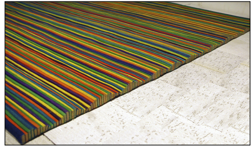
Fig. 6. Joanna Rusin, Pasanka , carpet, 2005/2009, prototype 2005. (© Joanna Rusin)