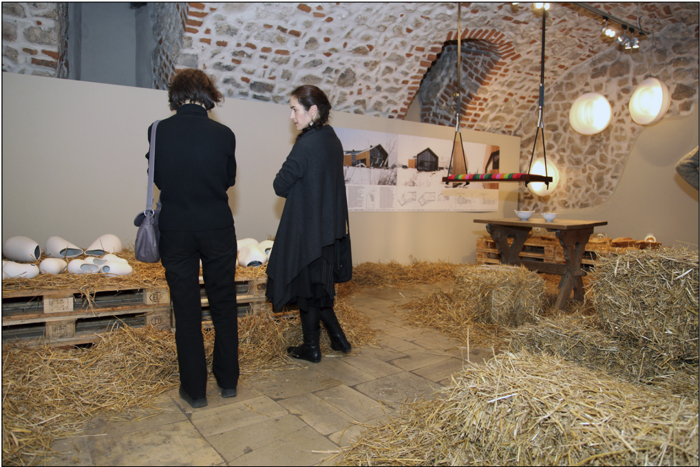
Fig. 1. Natural Resources of Polish Design , exhibition curated by Agnieszka Jacobson-Cielecka, Ethnographic Museum in Kraków, Ethnodesign Festival, 2009.

Subsequently, Polish-language coverage of the new wave of folk inspiration in design in the first two decades of the 2000s almost unanimously avoided any Polish wording suggestive of a connection with the compromised folk words (n.: lud ; adj.: ludowy ), instead making use of the English-sounding term etnodizajn . The fact that folk-inspired design is today being exoticized with an English-sounding name in order to win acceptance among the modern Polish public clearly suggests that a taste for folk is intrinsically inscribed in the modern perception of taste, regardless of political systems and their accompanying ideologies. Even though the term ludowy has lost its attraction, a shift in vocabulary has made it possible to use the same “natural resources” of Polish design as have been used since that design itself began. The etnodizajn presented in Jacobson-Cielecka’s exhibitions was not apparently aimed at the programmatic construction of a national style based on the vernacular, unlike previous uses of folk in Polish design (cf. SZCZERSKI 2011), although there were several similarities in the approach to folk as form and in its meaning as constructed in the early 20th century (Fig. 2).