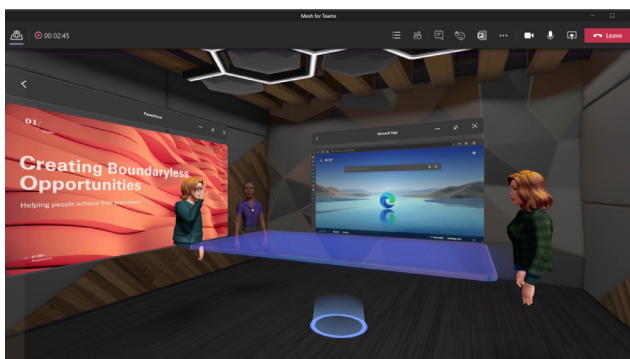
Fig. 2. Virtual meeting places in Teams 2022

Meta’s AI Research Supercluster (RSC) computer system will serve to handle communication among tens of thousands of users, including sophisticated content filtering and moderation. Currently, the cluster uses 6800 graphic processors, and can complete machine vision tasks 20-times faster than the competitors. When completed, it will have 16,000 GPUs, one exabyte of memory, and will perform AI learning at 16 TByte/sec speed. VR support for Messenger has been launched already, and voice calls will be included with the system in the near future.