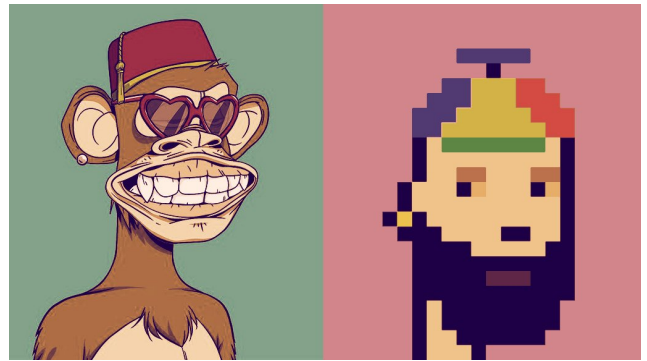
Fig. 7. A Bored Ape and a CryptoPunk: the most popular and largest Ethereum profile picture projects based on NFT.

Decades ago, VR spaces and the underlying technologies were science fiction, and simply reflected how authors imagined the future. In the meantime, a parallel but synergic evolution of various technologies offer a new, combined reality