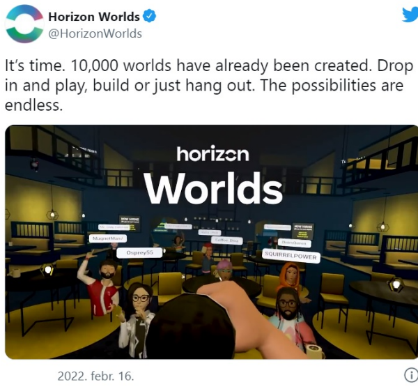
Fig. 1. Promoting Tweet of Horizon World