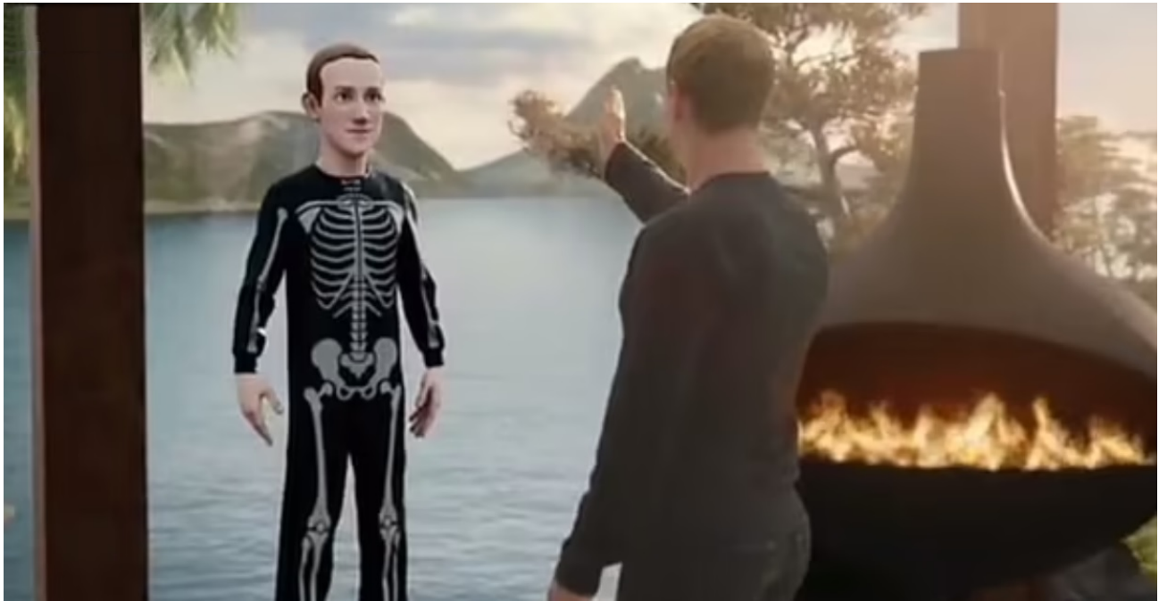
Fig. 3. In Meta's Metaverse, people create avatars of themselves with specific facial expressions or skin colors. The Cambria headset is specifically designed and it will includes sensors that enable a user's avatar to make natural eye contact in real time.

especially important [12]. Designers are still human actors, although artificial entities can also evolve to designers in the future.