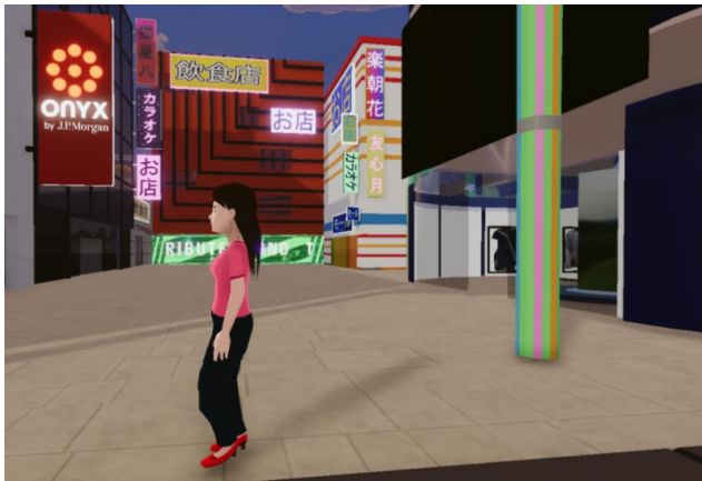
Fig. 5. JP Morgan's virtual property in Decentraland

published a short report on the Metaverse and revealed that the company acquired a piece of virtual property in Decentraland (Figure 5).