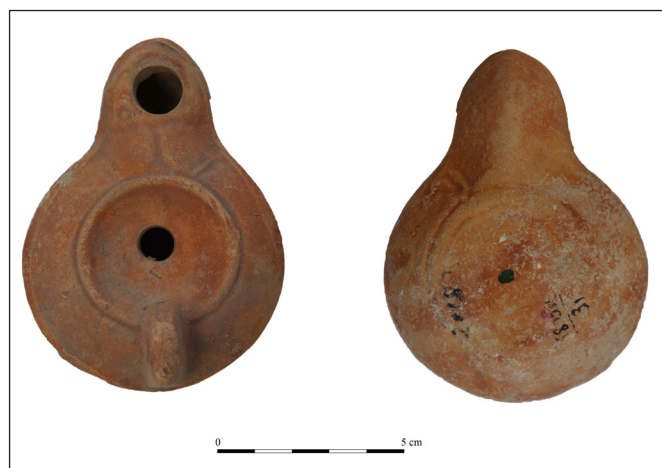
Fig. 2. Late Roman ceramic lamp, Tomb 1/1958, al-Makr, Israel

In-depth investigations into the chronology of the single object classes recovered from Galilean mortuary contexts is indispensable, even more so because at the present state of research, the transition between the typical Late Roman (late third to ca. mid-fifth century CE) and Byzantine ( ca. mid-fifth to earlier seventh century CE) 5 jewellery and costume accessory types is not very well understood. This gap is partly due to the fairly low number of published mortuary assemblages covering the fifth century CE (see e.g., TACHER, NAGAR & AVSHALOM-GORNI 2002; GORIN-ROSEN 2002), and partly to the dearth of the necessary fixed points provided by cross-cultural dating on the strength of better-dated assemblages known from other regions of the Eastern Roman Empire and her fringes, which offer reliable anchors for dating the multiple burials characteristic for the Levantine sites of the Late Roman and Byzantine period (Fig. 3). On the other hand, systematic surveys in Upper Galilee indicate that – to a certain degree in contrast to the Jewish parts of Galilee (LEIBNER 2006) – set-