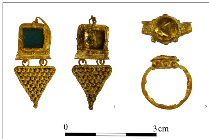
Fig. 1. 1. Pair of Late Roman golden earrings, 2. Late Roman golden finger-ring, Tomb 1/1972, Khirbet Alya, Israel

glass vessels of open shapes (bowls, beakers, etc.) in funerary assemblages was gradually abandoned during the fourth and early fifth centuries, while the frequency of pottery lamps, a commodity rarely present in Western Galilean mortuary assemblages until ca. the turn of the third and the fourth centuries CE (STERN & GETZOV 2006, 120–121), rose significantly (Fig. 2), especially in the fifth century and later. Since these and other changes took place within the span of a century or slightly more, and since the studied tomb assemblages do not all reflect the same mortuary rituals, a detailed chronological scrutiny of each mortuary assemblage and site is needed to trace these changes, first on the level of the family and the community, and then on that of the micro-regions. Based on the patterns gleaned from this investigation, we can then attempt to reconstruct the mortuary rituals leading to the deposition of the known artefact types, which, in turn, will provide important clues for explaining the shifts which had taken place between the third and the seventh centuries.