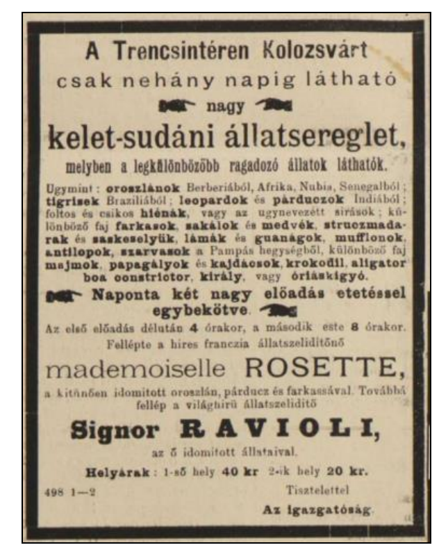
Pic. Nr. 3. "Menagerie of East-Sudan." Advertisement for a traveling zoo and animal taming show. 1895. Magyar Polgár [Chuj-Kolozsvár]. Vol. 9. 158. [no page numbers]

In the period that followed the Second World War, imports of luxury and even exotic goods were not promoted in Hungary. The 1950s, however, which were known explicitly as a decade of poverty, saw the renaissance of the "Alligators in the Sewers" legend. In the later decades of Socialism, however, there were new developments. The keeping of small reptiles in terrariums became increasingly popular throughout the world. In the way of all trends, this one was also taken to the extreme: the keeping of large wild animals as pets in the West was a way of showing off or an expression of eccentricity. An illegal industry grew up around the hobby, and although from time to time there are reports of the discovery of smuggled animals, this bizarre moneymaking enterprise continues to flourish.<sup>39</sup>