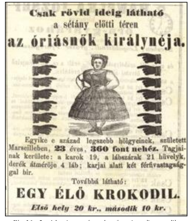
Pic. Nr. 2. Advertisement for a show featuring a live crocodile. 1871. Szegedi Híradó. Vol. 13. 116.

In the interwar period, crocodiles were mentioned in the Hungarian press rather as the raw material for bags, wallets, and shoes. At the time, fur and leather coats, footwear, and other accessories made from the skins of wild animals were regarded as prestige objects, suggesting prosperity and luxury. Demand for snake and crocodile skins was met chiefly by the Far East, where animals were bred on crocodile or snake farms as sources of special reptile leathers. Wearing snake or crocodile skin dresses still fit into the paradigm of dominating nature.