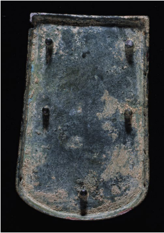
Figure 4: Back view of the camel plaque, Courtesy of the Institute of History and Philology, Academia Sinica