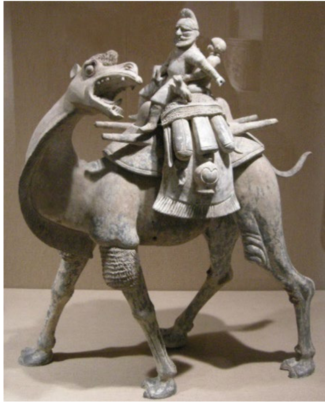
Figure 7: Tang Dynasty camel figurine from the Metropolitan Museum of Art.