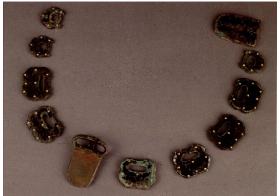
Figure 6(a-b): Tang Dynasty jade belt set and its bronze technological counterpart from the collection of the Shaanxi History Museum (Tian 2016: 67, figures 11-12)