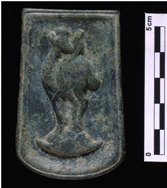
Figure 1: Front view of the camel plaque.