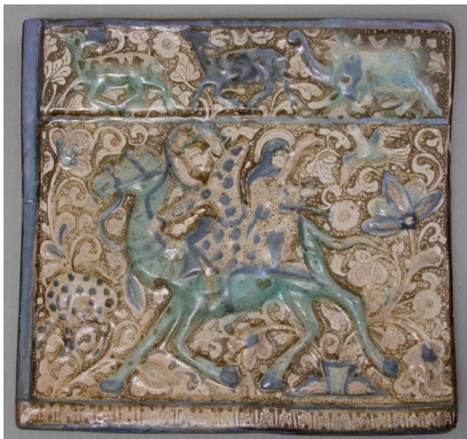
Figure 8: Tile depicting Bahram Gur and Azada.