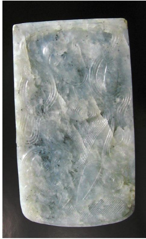
Figure 5: Early Liao Dynasty jade strap-end with pattern of human figures from Inner Mongolia. (Gu, 2005: 82)