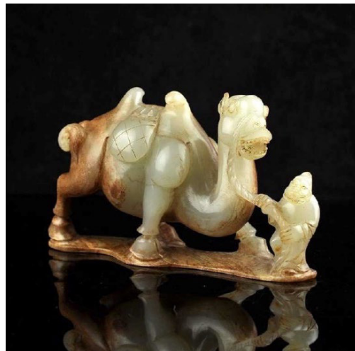
Figure 9: Jade camel figurine represented with a thick curly tail.