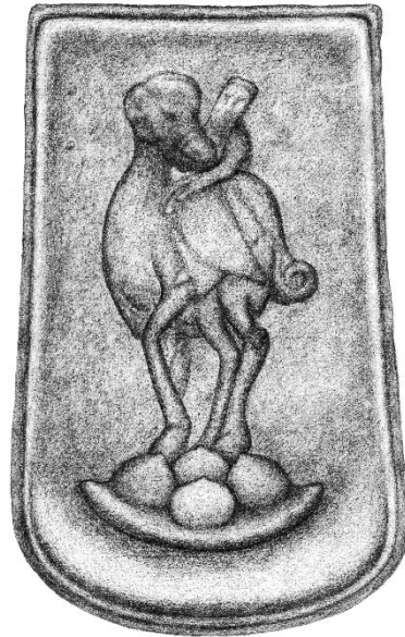
Figure 2: Drawing of the plaque.