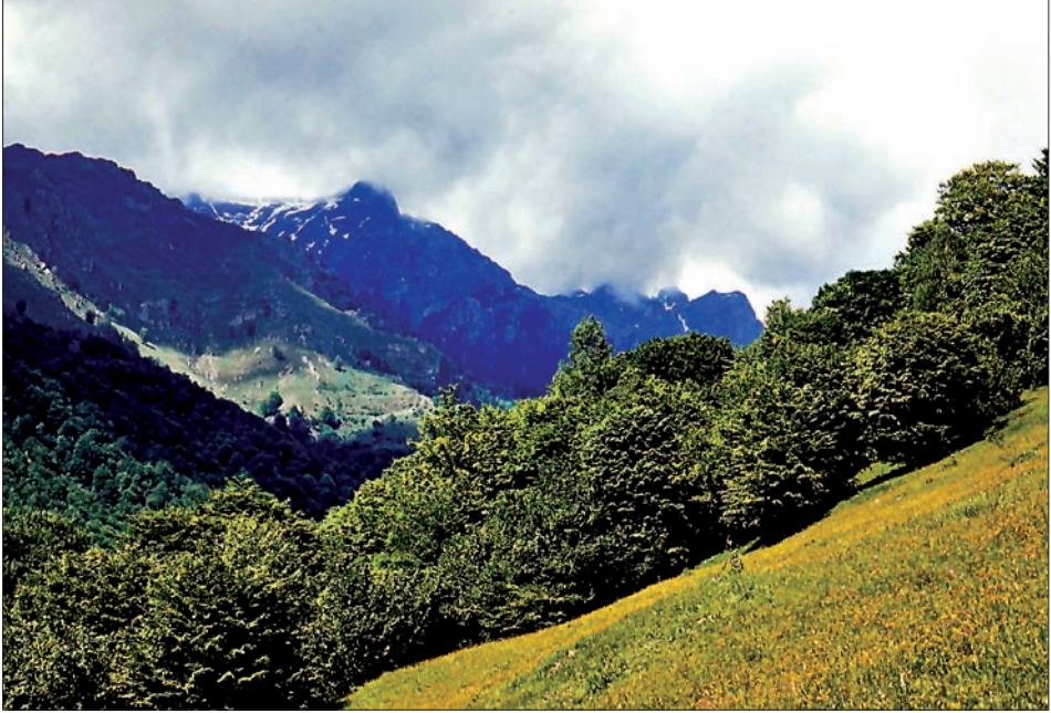
Fig. 2: The landscape from Rila valley