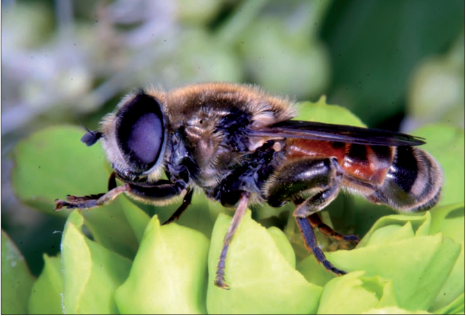
Fig 8: Merodon nigratarsis Rondani, 1845