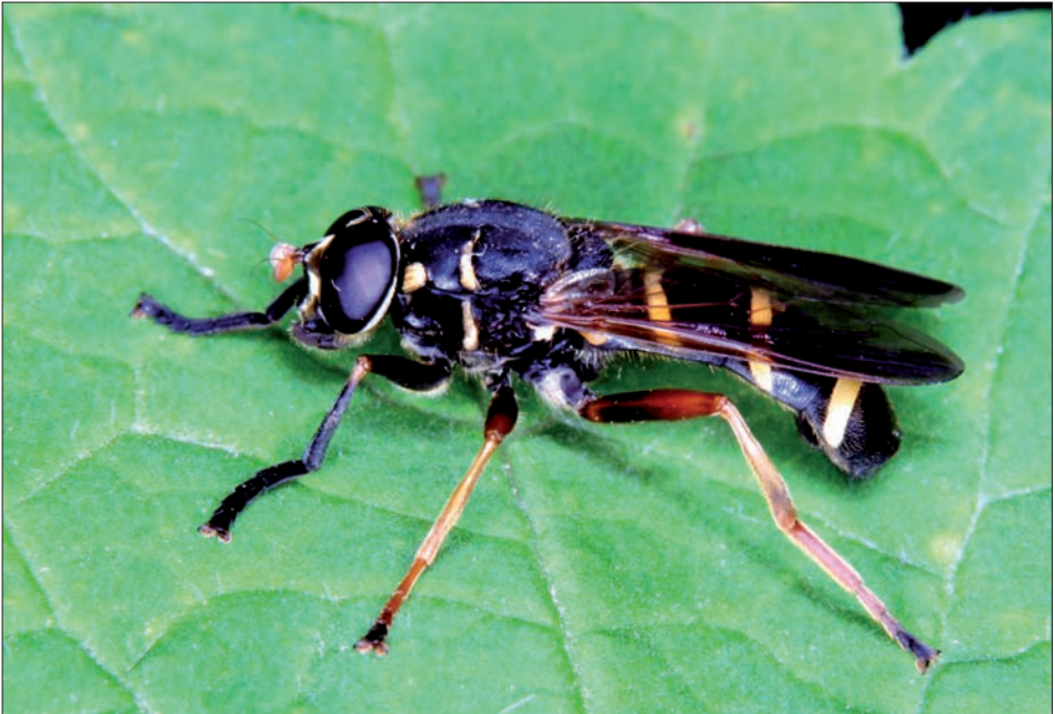
Fig 9: Temnostoma bombylans (Fabricius, 1805)