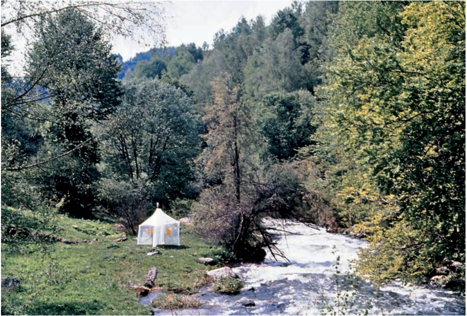
Fig. 6: Struma valley with Malaise trap