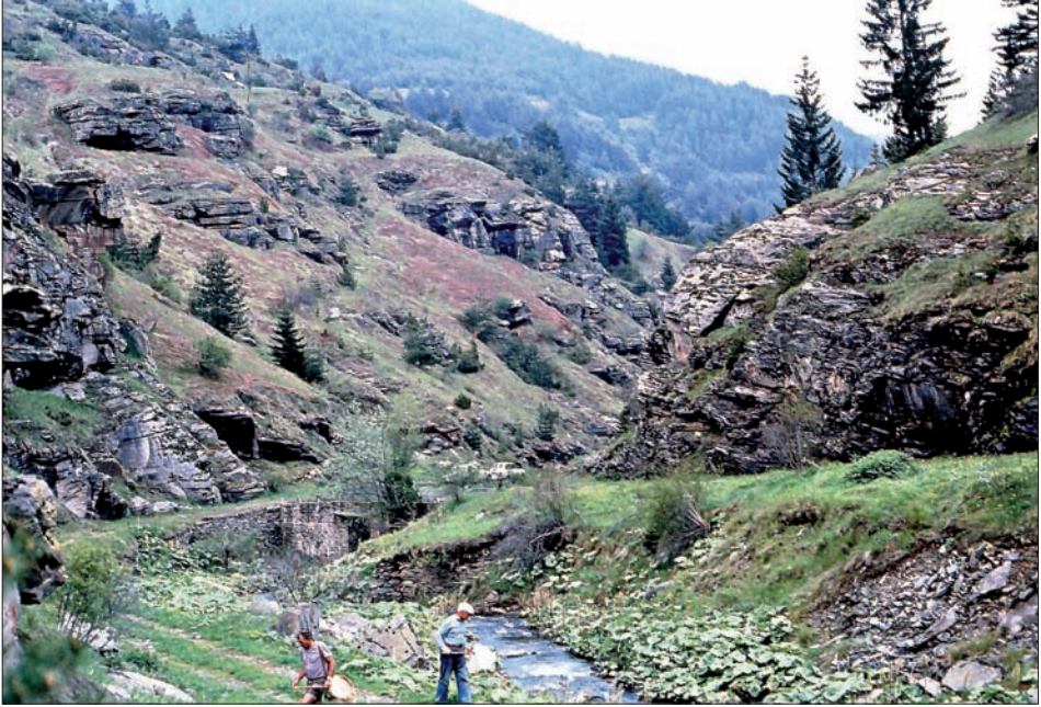
Fig. 4: Characteristic landscape in the Rodope Mts.