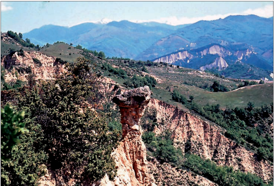
Fig. 2: Collecting sites surrounding Melnik