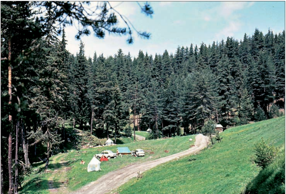
Fig. 7: Collecting site and camp near Satovcha