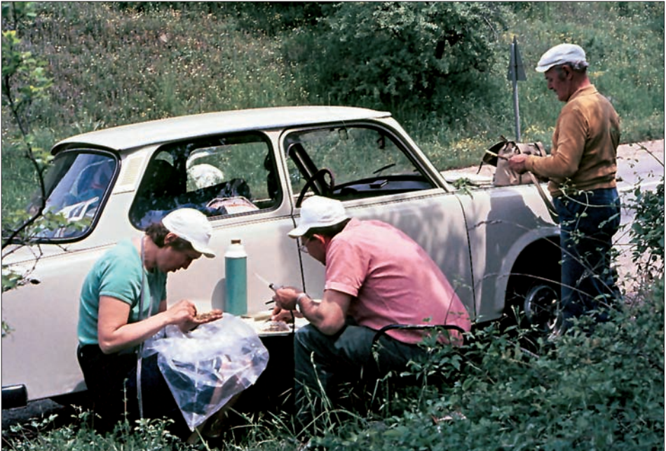
Fig. 5: Sorting the collecting material