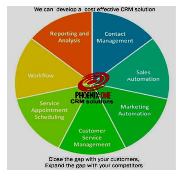
Figure 1. Cost-effective CRM applications

partner companies, and orders and requests for offers can be accurately tracked (Figure 1).