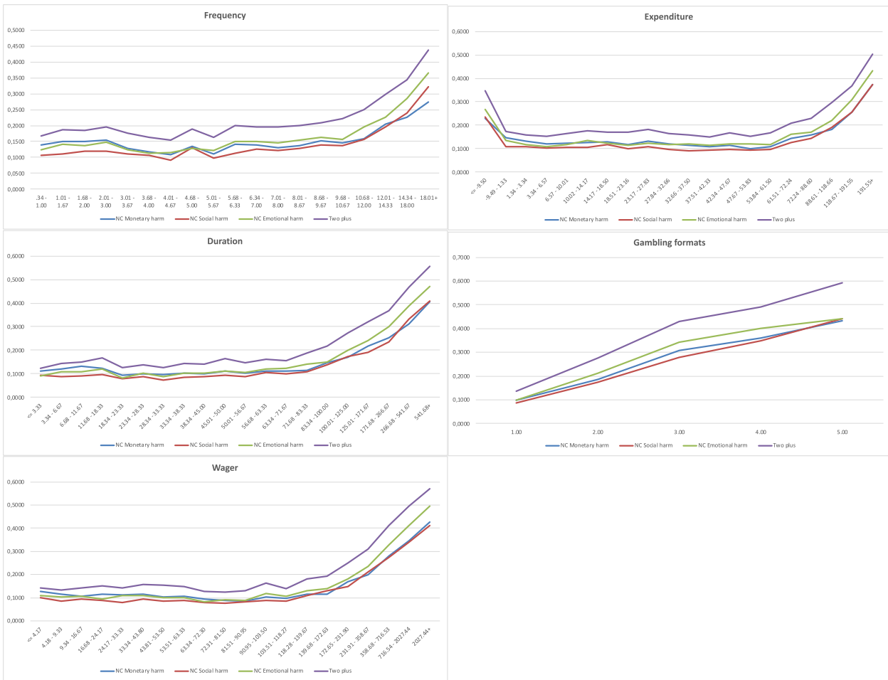
Fig. 1. Risk curves for frequency, expenditure, duration, gambling formats and wager on Two plus harm and financial harm, social harm and emotional harm

Although AUC of 0.60 is considered adequate for longitudinal prediction (Currie et al., 2017), these AUC values are somewhat lower than previous research with data from prevalence studies, which is surprising given that the current objectively recorded gambling data include less measurement error than reported data. However, because only the individuals gambling with NT was captured, gambling on other platforms may also be contributing to gambling-related harms. In previous risk curve analyses using prevalence data, all gambling is normally included in an individual’s self-report, albeit influenced by memory and other reporting biases.