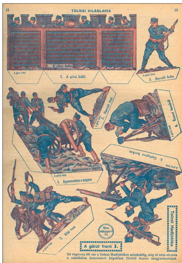
Figure 3 A görzi front I [The front at Gorizia I.]. Detail from the war game in Tolnai Világlapja

hinterland undoubtedly contributed to war games losing their former popularity, as we read in a report published in the 1916–1917 academic year by the state elementary school for boys and girls in Karánsebes (now: Caransebeș, Romania): “However, their state of mind [i.e. that of the children] has been debilitated by the long war, they are generally depressed and they play fewer war games. This is because in most cases it is not only a brother but also the father who is away from the family for months; many have died as heroes or are languishing in prisoner-of-war camps on foreign soil, and