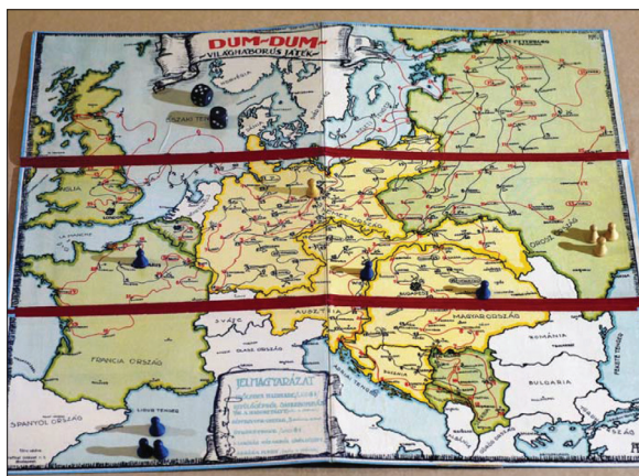
Figure 2 DUM DUM board game with figures and dices

“Our loved ones will return from a victorious war, and we will be able to proudly tell them that we know the entire battlefield soaked with precious Hungarian blood! [...] We have also fought! We have also been victorious!” Next to this text, also on the inside of the top of the box, are the rules for DUM DUM , according to which there could be two or more players, each representing nations (Hungary, Austria, Germany, France, Belgium, Russia, England, Serbia, Montenegro). The sides are allocated by drawing lots, which shows that the makers of the product were probably aware that children