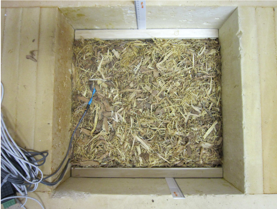
Figure 1. Chipped bark of black locust is placed in the measurement box for testing.