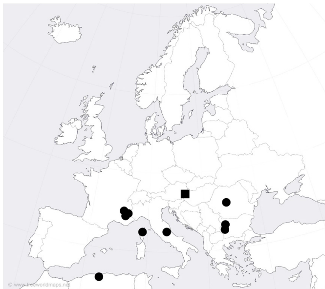
Fig. 6. Worldwide distribution of Idaea spissilimbaria (Mabille, 1888), dots: earlier records, square: the new record from Hungary

The collecting site in Hungary is somewhat reminiscent to those in Bulgaria reported by BESHKOV (2010), dominated by gardens, grassland and neighbouring forest. The following differences may be important: in Bulgaria the sites were situated around 900 m a.s.l while in Hungary the site was at much lower elevation, 370 m; the bedrock in Bulgaria was calcareous while in Hungary it was slate; and the nearby forest in Bulgaria was made of Carpinus species while in Hungary it was an oak woodland.