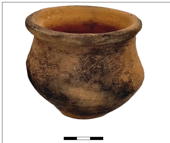
Fig. 6. Late Avar Period vessel found as a grave deposit in the burial pit

During the 2023 campaign, we verified the site as the unearthened soil layer sequence proved identical to those unearthened by Vértes and Kriván; the discovered Late Avar Period burial in Trench 5 also corroborated the match. We plan further pedo- and sedimentological analyses, which may provide a better understanding of the surface formation and chronology of the site and contribute to a more accurate dating of the chipped stone assemblage stored in the collection of the Hungarian National Museum.