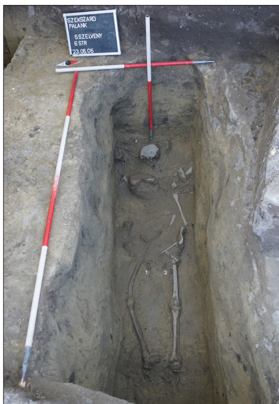
Fig. 5. The unearthened Avar Period burial

4 consisting mainly of loamy sand/sandy loam layers, we could not identify the characteristic loess layer recorded by Pál Krizsán.