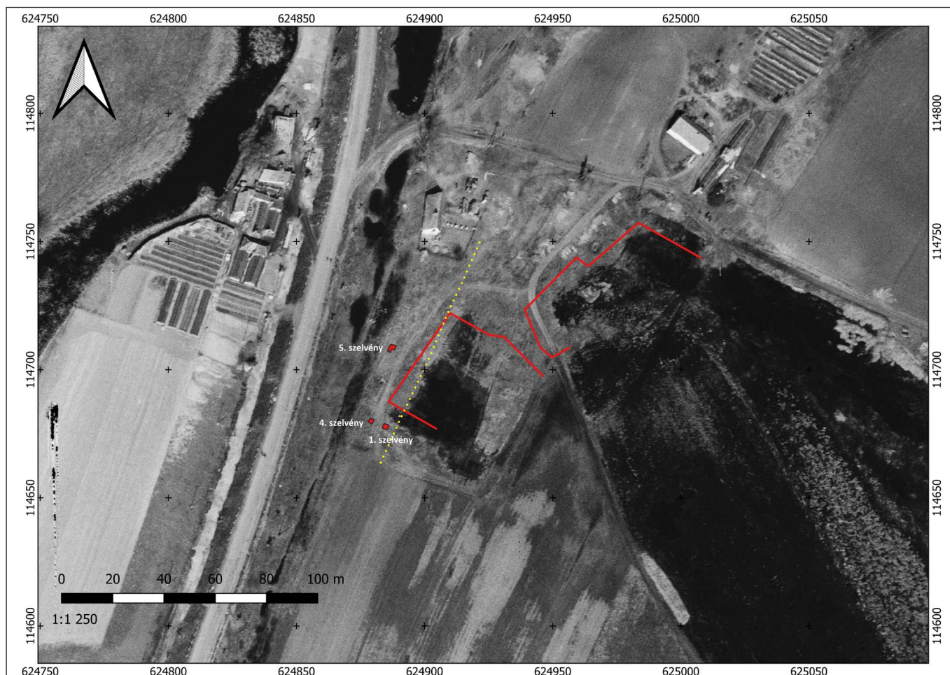
Fig. 3. Area of the site on an aerial photo taken in 1968. Yellow dashed line marks a public utility line, red line marks the reconstructed mining area, and red squares mark Trench 1, 4, and 5 (map by Kristóf István Szegedi)

ering the above, the excavation trenches were marked out west of the utility line and the one-time front wall of the mine.