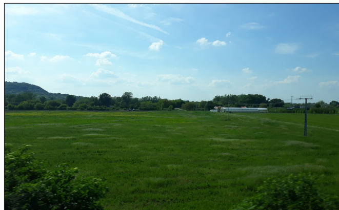
Fig. 2. The archaeological site from the east, with the Szekszárd Hills in the background

Based on the stratigraphic sequence, Pál Kriván assumed that the site is located on a lower terrace of the Danube, on a lower fluvial stratum that formed during the Bølling–Allerød Interstadial (14.7–12.9 thousand years ago based on current data) and became covered by a thin layer of loess in the younger Dryas (12.9–11.7 thousand years ago based on current data). Next, fluvial sand was deposited