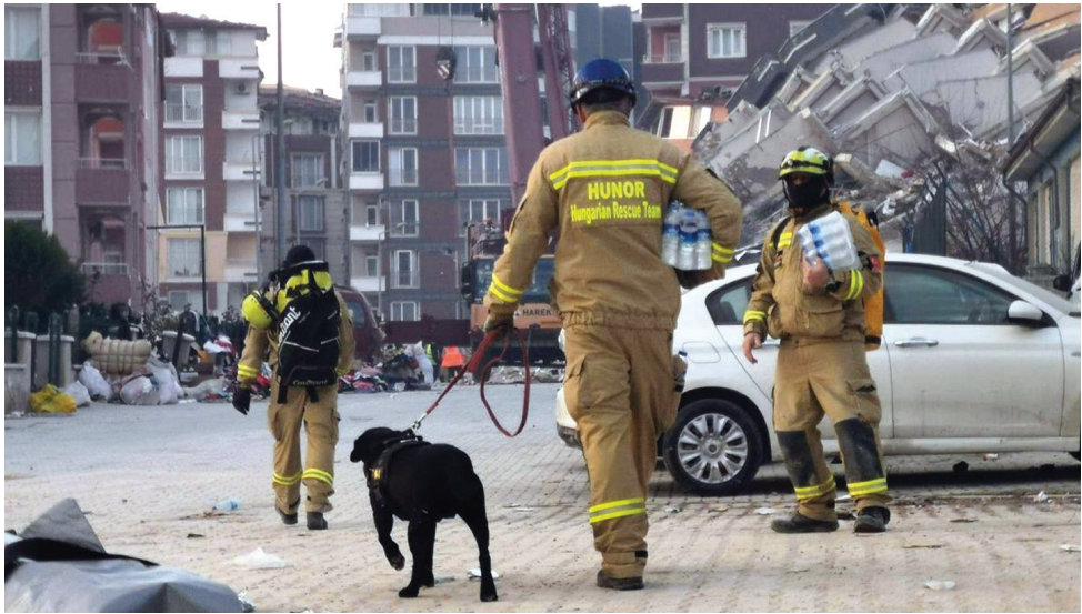
Figure 3: HUNOR in Antakya