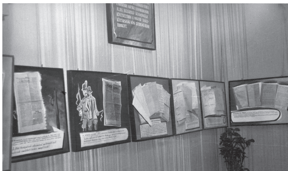
Figure 2: The Exhibition of Railworkers' Union for the 40 th Anniversary of the First Hungarian Soviet Republic. Historical Photographic Records of the Hungarian National Museum 48. ME/II/B, Culture - Exhibitions 1957–1962, Registry no. 59. 524.