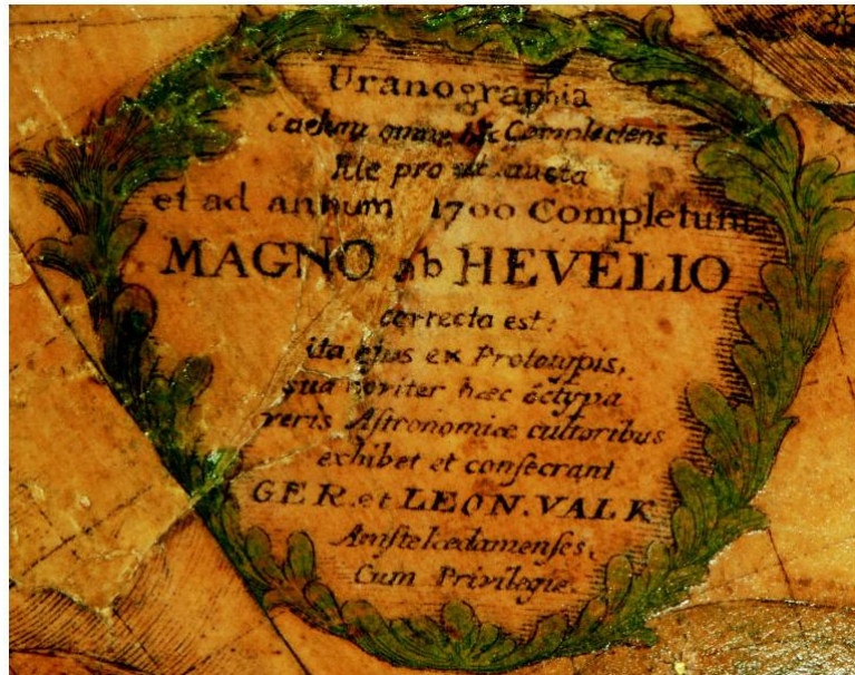
Figure 2. The title field.