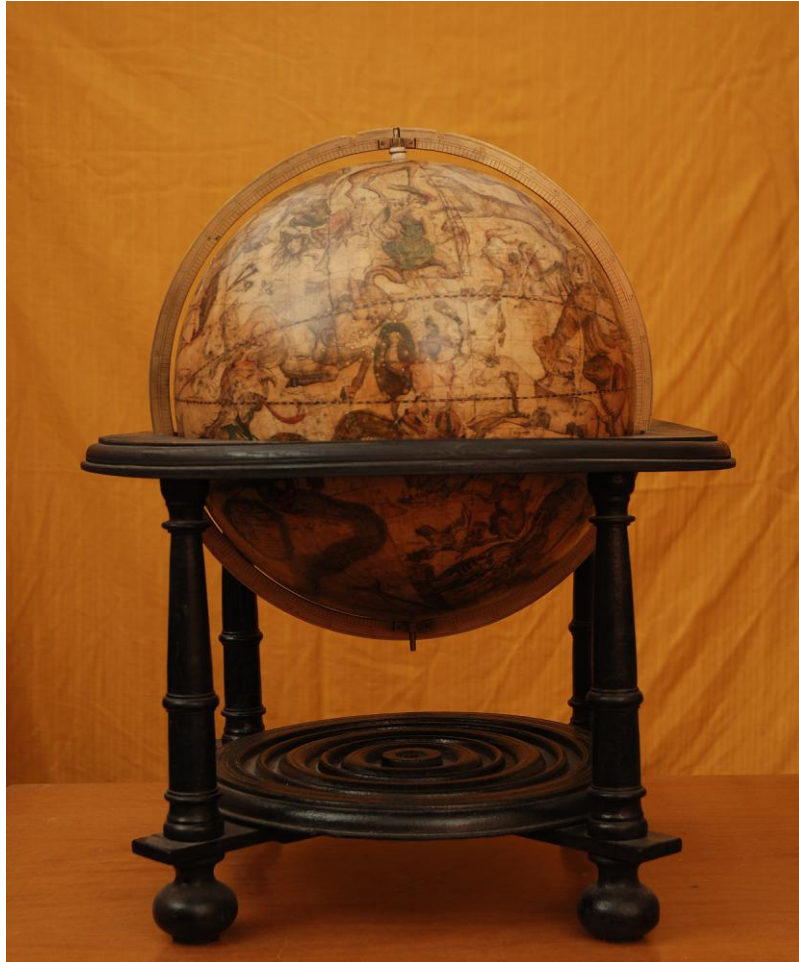
Figure 1. The Valk's celestial globe in Debrecen.

The globe was published in Amsterdam by the Valk family, though some sources say that the publisher was Hevelius. The Valk firm made the globe by using the star atlas of Hevelius from 1690. The epoch of the celestial globe refers to 1700. He published several other celestial globes, all with the title of Uranographia , which was originated from the title of the atlas of Hevelius. The globe is 31 cm in diameter and is made of papier-maché, a composite material. This consists of paper pieces or pulps, sometimes reinforced with textiles, bound with some adhesive material. The sphere is covered with a plaster coating and two sets of 12 half gores, clipped at the ecliptical latitude of 70^\circ , and two polar calottes. The gores are copper-engraved, hand-coloured (stars in gold), and varnished. The sphere is mounted in a graduated brass meridian ring. The hour circle is missing from the North and South Pole of the globe. The stand is wooden and there are four legs. Nothing supported the meridian ring. In other copy, the meridian ring is held up by a circular base-plate with a central pillar.