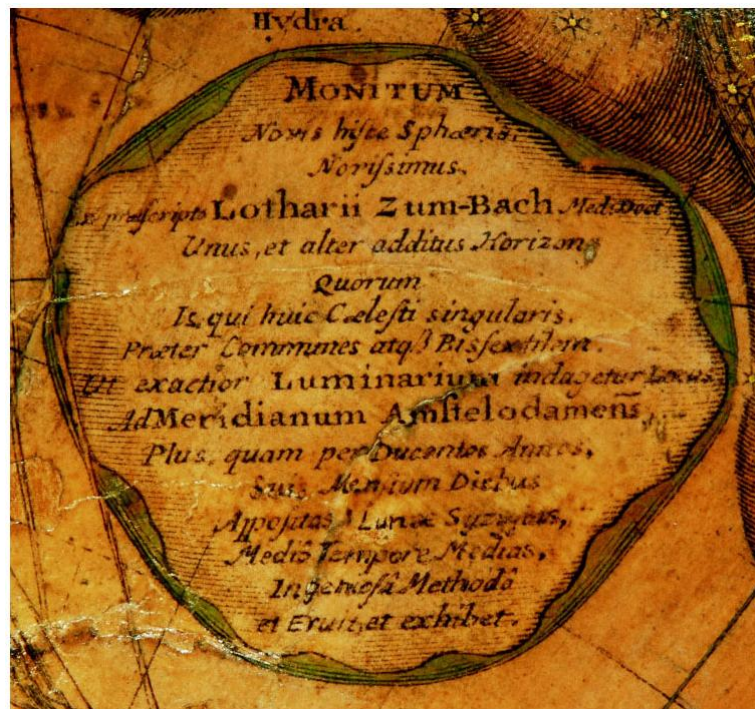
Figure 3. The legend.

Amstelodamens. Plus quam per Ducantos. Annos Suis Mensium Dielbus Appositas Lunae Syzygias, Mediô Tempore Medias, Ingeniosa Methodô et eruit, et exhibet.”