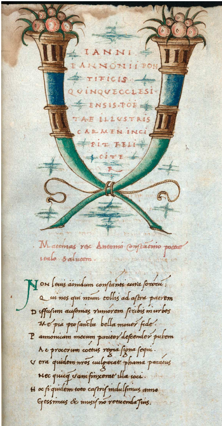
Dresden, SLUB, Mscr.Dresd.Dc.158 (D), f. 6r: El. 26,1-10; cf. above p. 14.