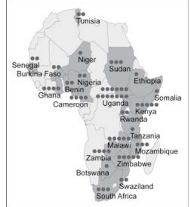
Figure 2. Map of Africa with number of responses by respondents' country of residence

A total of 70 usable, complete responses were obtained from respondents in 22 countries (see Figure 2). The gender breakdown was 57 (83%) male and 12 (17%) female, the majority either associate or assistant professor, and most of them in their forties or fifties.