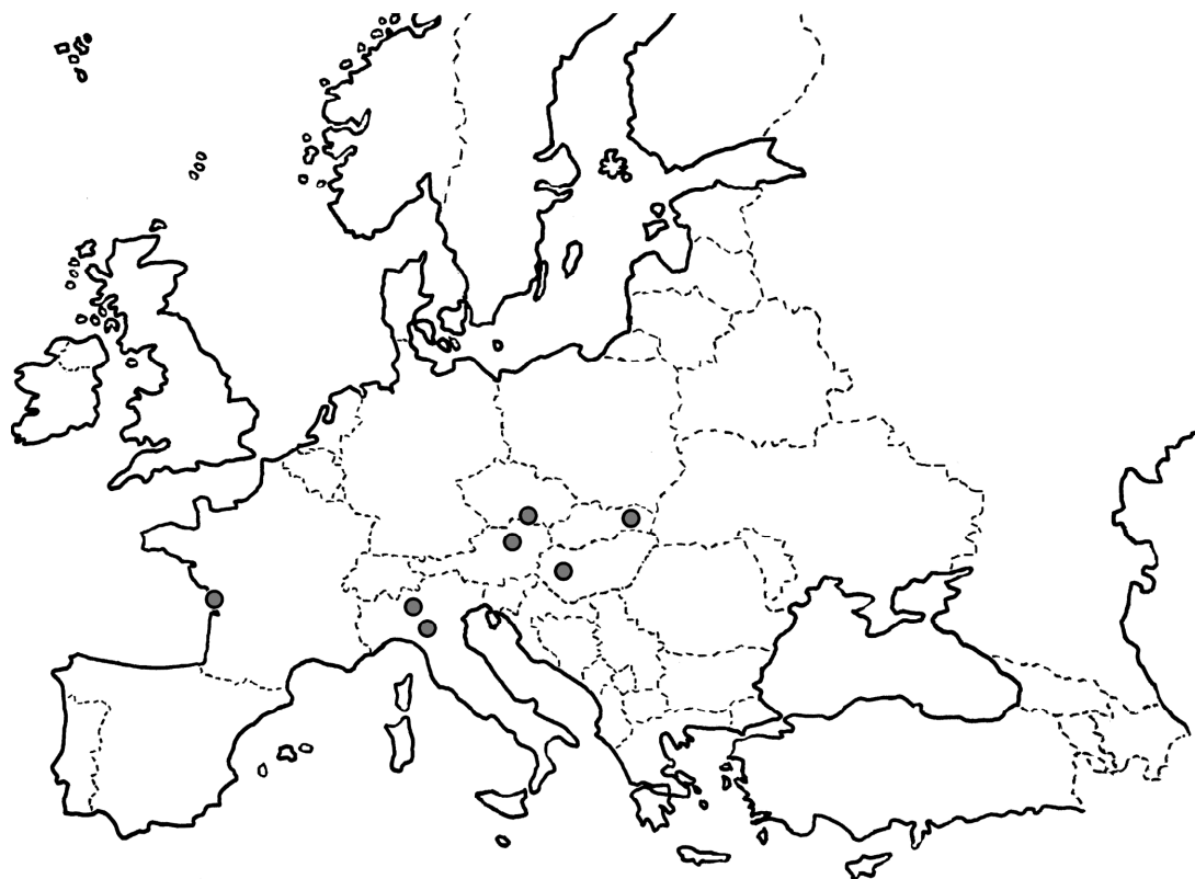
Figure 4. Distribution of Chthonius ressl in Europe.

The morphological and morphometrical characters of the specimens found correspond well with Beier's original description (Beier 1956) and with Judson's redescription (Judson 1990). However, a greater variability was observed in the number of chelal teeth, the number of spines of coxae II and in the measurement data. With respect to our present knowledge, after its recording from Slovakia, this is the second report of this species from the Carpathian Basin.