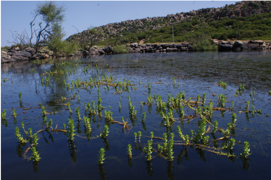
Fig. 2. Habitat of Elatine alsinastrum at Koyunevi Köyü (Çanakkale) (photo: A. Molnár V.).