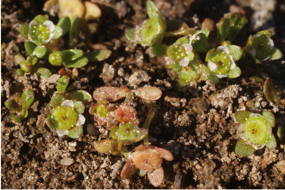
Fig. 1. Flowering and fruiting specimens of Elatine macropoda at Behram Köyü (Çanakkale).