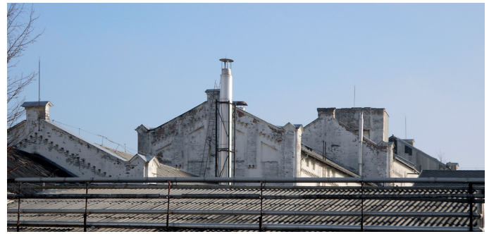
Fig. 2. The factory of "Első Óbudai Szeszétető és Finomító Részvénytársulat" in Óbuda, built in 1867.

The industrialisation and urbanisation changed the city's economic, social, physical and natural context over just a few decades. The distances, growing population and lifestyle had new needs for mobility, living and activities. Consequently, public transport became indispensable. The first horse tramway started to function along Váci út, parallel to the Danube, in 1866; the suburban railway transport, the HEV was created in 1887. Most of the lines follow the river, North Buda (HÉV Szentendre), South Pest (HÉV Csepel, Ráckeve) and South Buda (HÉV