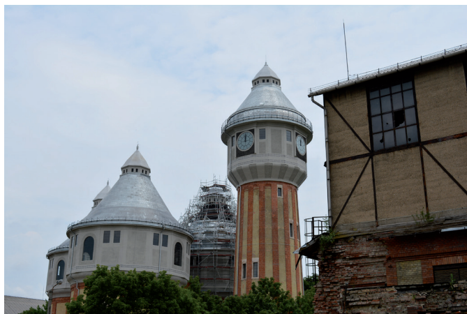
Fig. 5. Former Gas Factory on the Óbuda riverbank, 2012.

The question arose as to what kind of process would help the renewal of the abandoned brownfield sites? In the Budapest 2030 Long-Term Urban Development Concept that was published in 2013, the problem of brownfield sites is among the most significant topics. Following this strategic document, the municipality of the capital launched three thematic development programmes - the renewal of brownfield sites, the development of the Danube riverbank and social housing - searching