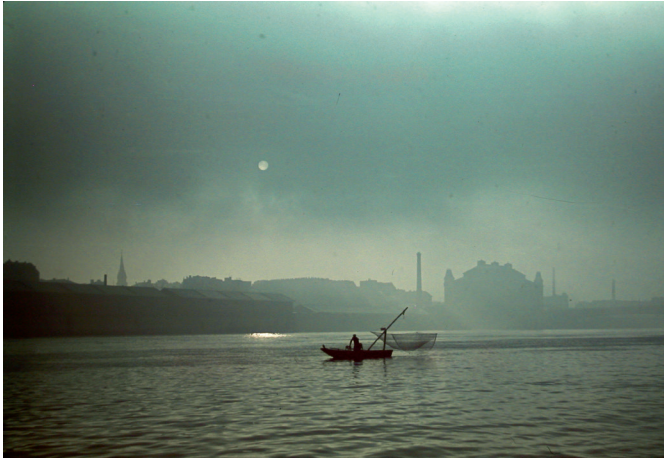
Fig. 3. Danube and industry, Budapest, 1940.

established new institutions, and Budafok became the area for beer, wine and champagne production. The most important factories also had a direct railway connection. It was reasonable to divide goods transportation and passenger traffic using the same railway lines; however, in several cases transfer and passenger stations functioned separately. In Pest, the Lipótváros transfer station served the northern industrial area, the Ferencváros and Duna stations, the southern part of the city. (Fig. 3)