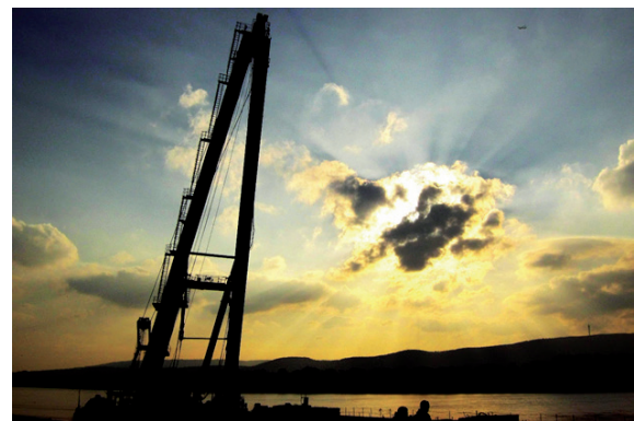
Fig. 4. Nature and industry, Budapest, Népsziget 2014.