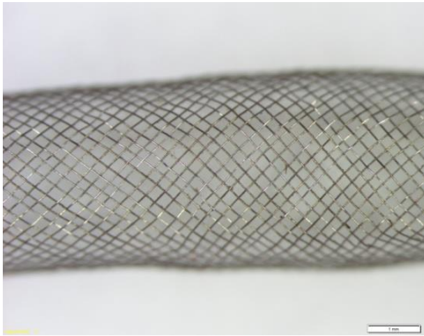
Fig. 1. Sample "A"

During this study FD-s of different diameters were tested from two different manufacturers. Stereomicroscopic images (Olympus SZX16, Olympus, Tokyo, Japan, magnification: 20×, Figure 1-3) demonstrate the wire pattern when fully expanded and not bended.