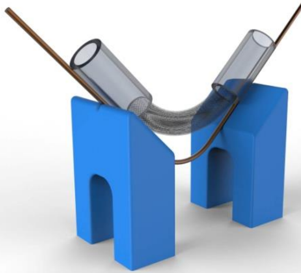
Fig. 5. The stent positioning holder

To observe the change of the muster, a holder was created to hold the sample in different angles without affecting the wire pattern. Both ends of a sample were placed in a silicone tube, as the silicone surface gives good adhesion, which promotes attachment of the sample at that position during bending. The angulation was stabilized by wires bent to the required angles. The angled section of the FD remained free from both the wires and the silicone tubes for unrestricted observation. Considering the nominal diameter of the samples, a 5 mm internal diameter silicone tube was chosen, making sure that compression has not changed the wire pattern during the investigation. Then the samples were put in the tube thus formed a bent position required for measurement. Figure 5 shows an illustration of the holder.