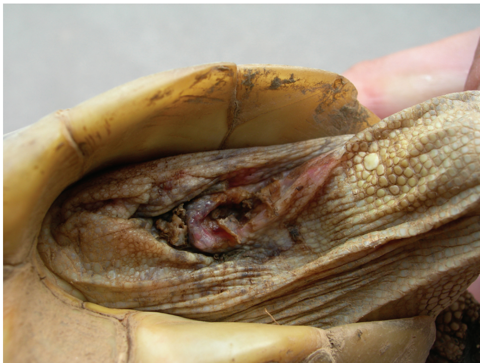
Fig. 3. A complication (myiasis) a few days after microchip application

In 2010, it was determined that over a period of time (i.e. three, four or five years) a loss of microchips occurred. A total of 235 (4.6%) microchips were unreadable or lost. The proportion of microchips lost was 5.7% in males and in 4.3% in females (Table 1). No statistically significant difference in the loss of microchips was found between the two sexes ( \chi^2 = 0.078 , P = 0.781 ). One of the reasons for the higher proportion of microchip loss in males was the more frequent bleeding and consequent microchip loss within a few days after the microchipping procedure. At low temperatures, in rainy weather and at dusk tortoises very often buried themselves into the ground. This could result in non-sterile application, abscess formation and the consequent loss of the microchip over a long period. Gál (2006) described early and late complications of microchip implantation in tortoises. In addition to bleeding complications and abscesses, he also demonstrated embolism, nerve damage, paralysis, and urolithiasis. In our study myiasis was observed. To prevent such complications in the future, for animal welfare reasons we recommend daily observation for at least one week after the microchip implantation. Other possible reasons for microchip loss seen over the years were migration and elimination or inactivity of the implanted microchips. When we checked microchips (in 2010) we could not distinguish between the