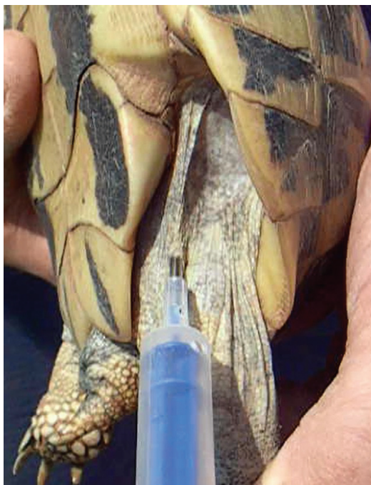
Fig. 1. Application of the microchip in the left inguinal region