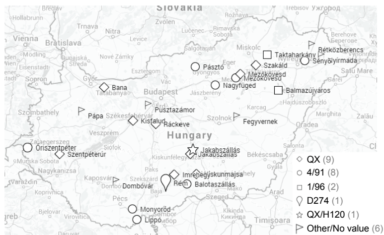
Fig. 2. Geographic distribution of the farms submitting the samples. The detected serotypes are identified with polygonal symbols

Reoviruses are frequently isolated from clinically normal chickens and the outcome of reovirus infection depends on several factors including age and immune status of the bird, route of exposure, virus pathotype, and interactions with other pathogens. Certain reovirus strains are even immunosuppressive and, thus, may enhance the severity of concomitant infections (Engström et al., 1988; Jones, 2013). While not sought for specifically, our results confirmed the ubiquitous nature of reoviruses in meat-type chickens (Jones, 2013), apparently in the lack of clinical disease.