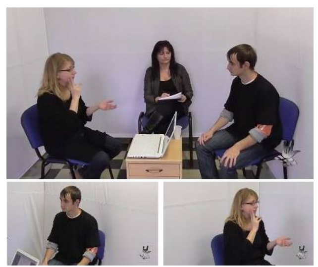
Figure 1: Sociolinguistic interview

During each interview there were 2 fieldworkers and 1 informant. The Fieldworker No.1 followed the questions on a laptop while conducting the interview, thus there was no need of holding the printed version. The Fieldworker No. 2 documented the answers, this way the Fieldworker No. 1 could actively sign and pay attention to the informant. The participants were situated at the three sides of an imaginary square. The informant was on the right side, opposite to the Fieldworker No. 1; the Fieldworker No. 2 documenting the interviews sat a little bit further behind, between the two of them, thus creating a right angle to both participants. We used 3 cameras for recording the interviews: one for the overall picture, one only for the informant and one only for Fieldworker No. 1.