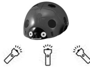
Fig. 1. The figure to explain the task

Task – ladybug: The ladybug of Szeged was designed and built by Dániel Muszka in 1956–1957.