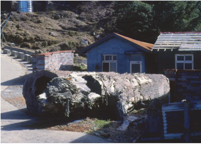
Fig. 6. The collecting site of Aradus oroszi sp. n.