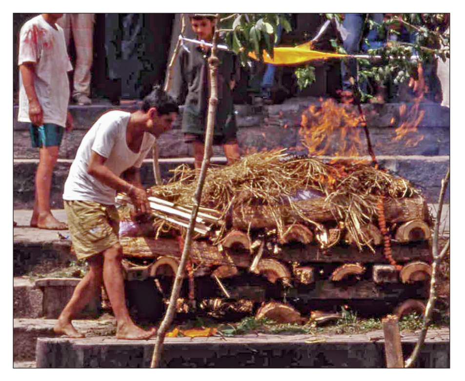
Fig. 2: The lighting process of a funeral pyre from a present-day Indian example (Oestigaard 2005, 14. Fig. 1.5)

The fundamental unit of investigation must be the creation of the individual graves as an event as opposed to the cemetery. However, for this to become something that can be examined it is necessary to supplement the important – but by no means full – general series of data (grave dimensions, orientation, the method of internment, the conditions of the body and the types and numbers of grave goods), which lead, even unintentionally, to the false approach in which the grave is considered a momentary event and the placement of the deceased and the objects in the grave are handled as an imprint. In contrast to this, numerous examples from ethnography and cultural anthropology show that burial is a wide ranging series of processes diversified through space and time with diverging actions and participants in varying numbers and roles.<sup>7</sup> Precisely due to this there is a need to pose questions from a new perspective in the archaeological investigation of the entire series of rituals; the micro-level analysis of the event history must be placed within the context outlined by typochronology and cultural classification, with the goal of reconstructing to the greatest extent possible the burial rituals of the individual people taking into account the actions before, during and after cremation.<sup>8</sup>