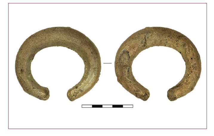
Fig. 5: Traces of burning and melting on a bronze bracelet from the Late Bronze Age cemetery of Újsolt