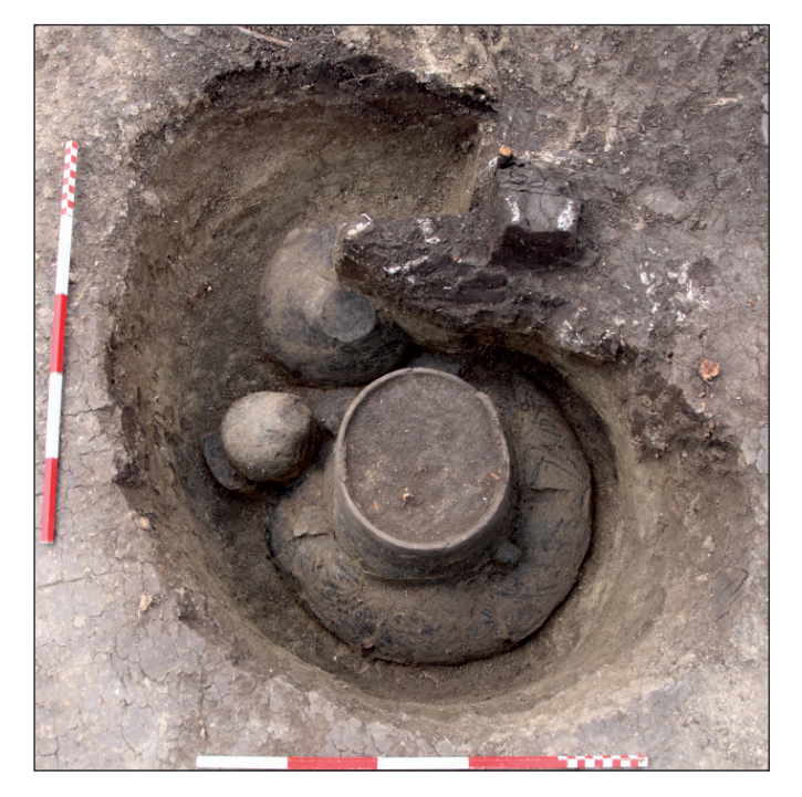
Fig. 7: Human remains scattered above a covered grave at the Jobbágyi-Hosszú-dűlő cemetery (Fülöp, Kristóf – Váczi, Gábor: Preliminary report on the excavation of a new Late Bronze Age cemetery from Jobbágyi (North Hungary). Dissertationes Archaeologicae Ser. 3. No. 2. (2014), Fig. 5.2)

The collection of the ashes can begin following the burning down of the pyre. The watering of the human remains and other ashes may have taken place to speed up the cooling of the remains, which may have also facilitated the cleaning of the bones and their meticulous, more complete collection. Arched cracks that split apart are the traces of this remaining on the bones that have fragmented into tiny pieces, and these are caused by a sudden change in temperature and the escaping steam.<sup>18</sup> The amount of ashes placed in the grave as the final stage shows a quite varying profile throughout the entire Bronze Age, and on the basis of investigations up to this point this cannot be correlated with either the age of the deceased, the quality of the cremation or the size of the vessel used as the funerary urn. However, the varying amounts, which stretch from 5-10 grams to 2,000-2,500 grams, clearly draw attention to the conscious manipulation of the former physical body, which could be reconstructed in a few cases at the Late Bronze Age cemetery at Jobbágyi.<sup>19</sup>