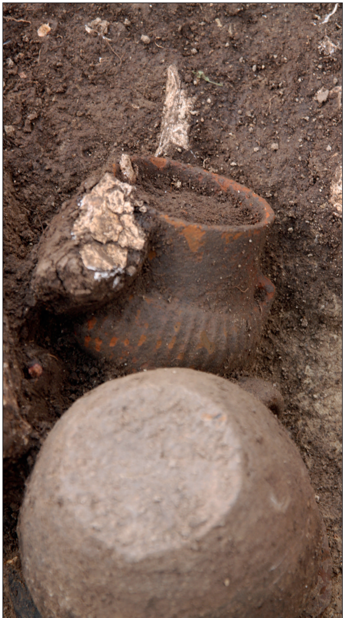
Fig. 6: In many cases it was possible to observe a close connection between secondarily burnt vessels and the human remains at the Jobbágyi-Hosszú-dűlő cemetery

Similarly to the ceramic objects, bronze objects can also be categorized according to their condition. In the first case traces of combustion or carbonized wood (embers) can be found ( Fig. 5 ). These objects were placed on the pyre after it collapsed and so were only partially burnt/melted. The second category is made up of those bronze implements that became cracked or partially deformed due to the high heat. Their reconstructed location may have been the outer area of the pyre, where temperatures were not as high, or possibly due to the irregular direction of the collapse of the pyre they were only subjected to high temperatures for a short time. The third group in the case of bronze objects is made up of thoroughly burnt objects that melted entirely into liquid. These spent enough time in the hottest part of the pyre that they are put in the grave along with the ashes as melted blobs or drips. It is not uncommon that they have incorporated burnt bone fragments during cooling. Similar to the ceramics, the possibility and success of analyzing the traces of use on these objects strongly depends on the condition in which the objects are found and the method and extent of their restoration.