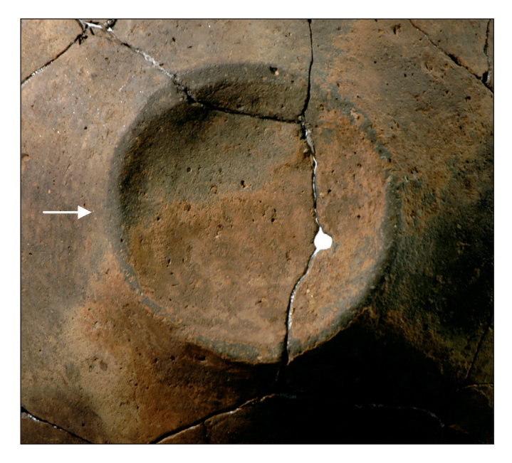
Fig. 4: Traces of wear on one of the urns from the Late Bronze Age cemetery at Balatonendréd

Kristóf Fülöp – Gábor Váczi • Late Bronze Age Cremation Burials: A Complex Event with Few Remains