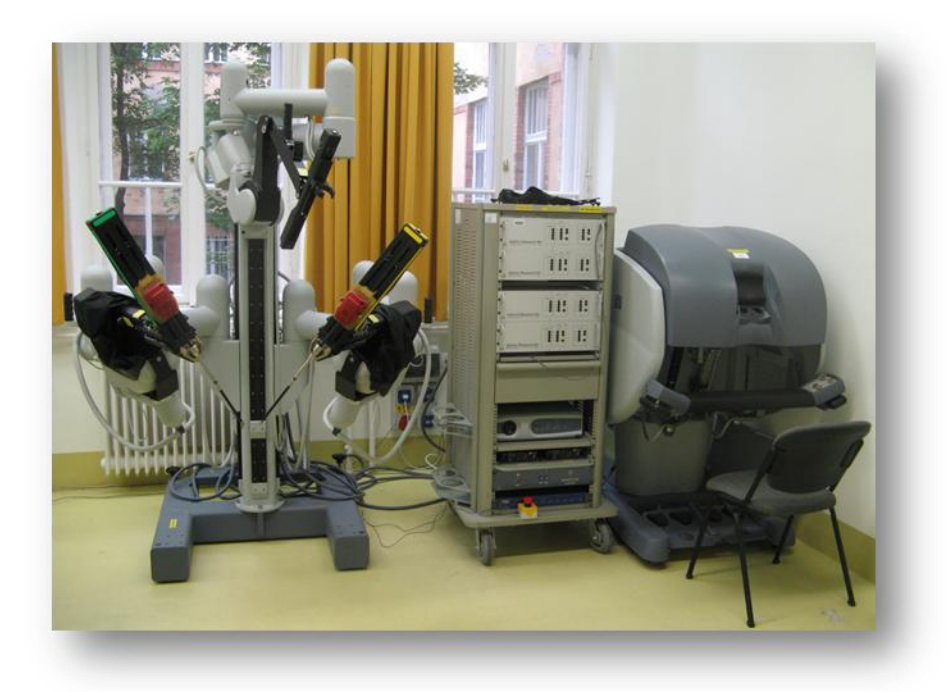
Figure 4: The da Vinci Surgical System and the da Vinci Research kit. System components: Patient Side Manipulators (left), the dVRK controller (middle) and the Master Tool Manipulators (right).

The PC-side operating system is preferably Linux-based, as there exists a real-time extension (RTLinux), a Linux OS that runs under the supervision of a hard real-time microkernel [34]. The software architecture, as a whole, can be divided into five functional layers (I-V) and three development layers (A-C) [35]. The functional layers, implemented on the PC side, are stratified by the complexity of their function, while the development layers are sorted by the programming language complexity they use. The open-source property is extensively supported by the previously described SAW and CISST libraries, allowing the system to be used as a completely open research platform.