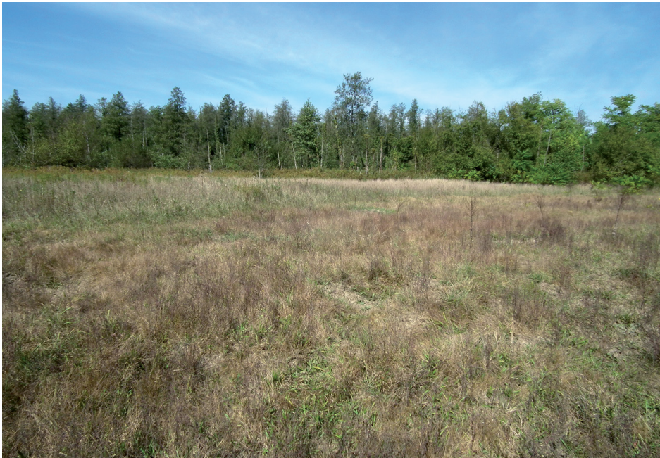
Fig. 3. Habitat of Sporobolus neglectus Nash near Vizvár (Jama) in Hungary: semi-dry secondary grasslands with dense stands of Sporobolus in the foreground, and common alder plantations in the background (28.09.2016,).