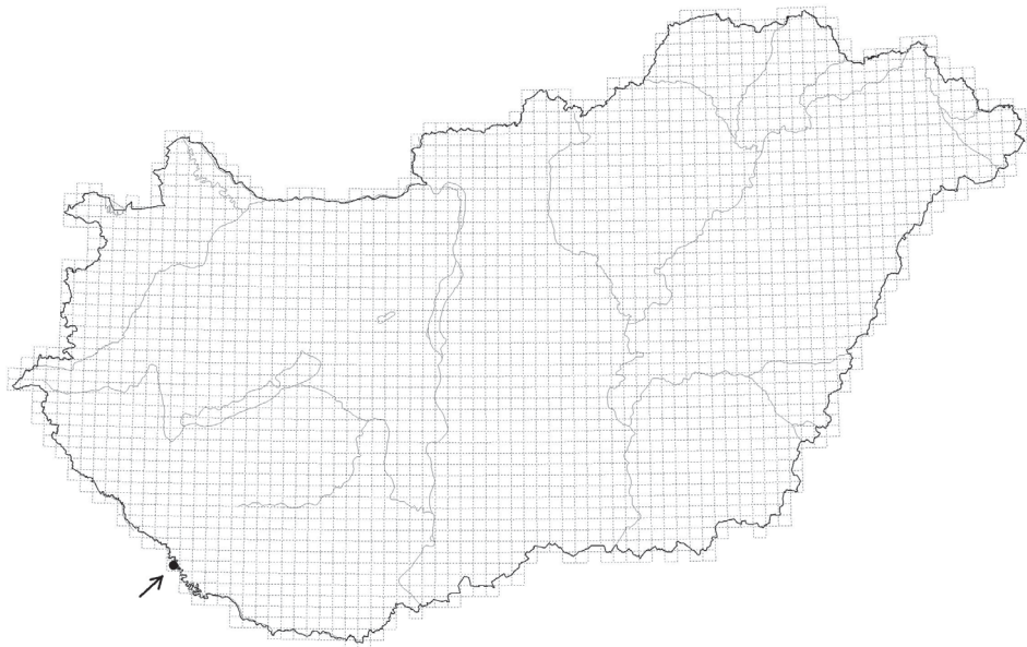
Fig. 2. Distribution map of Sporobolus neglectus Nash in Hungary.

Sporobolus neglectus composed in the sandy grassland part of Jama territory a nearly monodominant stand on approx. 0.2 hectares, its dominance was supported here likely by the repetitive damages (creating barren soil surfaces) of wild boar. The species composition of the dry and semi-dry grasslands was similar to those in other degraded sandy habitats in Hungary, with scattered