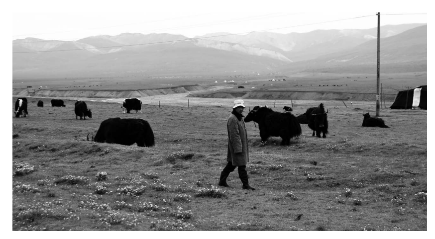
Fig. 6. Traditional Tibetan-type nomadic tent (kara yii) (on the right) with grazing sheep and yaks behind it in the Qilian Mountains.

state oracle not far from Lhasa. ^{40} Even though the Shira Yugurs do not have any el\check{c}i specialists and they follow Tibetan Buddhism (Gelug-pa) sometimes, in case of disease and other misfortune, they used to order rituals from the Kara Yugur shamans. ^{41}