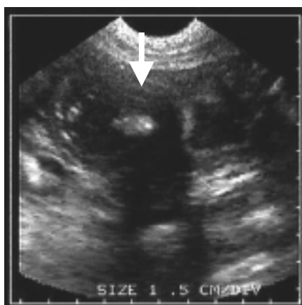
Fig. 3. Ultrasonographic image of the intestines of a dog with linear foreign body. The intestines are dilated and have plicated appearance. The foreign body is visible as a hyperechoic reflex with shadowing in the middle of the intestinal lumen (arrow)

Mechanical obstruction of the GI tract was diagnosed in 33 dogs including 14 dogs with intestinal invaginations, 10 dogs with ingested foreign bodies, 5 dogs with intestinal adhesions and one case each of intestinal torsion, linear foreign body (Fig. 3), diaphragmatic hernia and partial obstruction caused by intestinal tumour (liposarcoma).