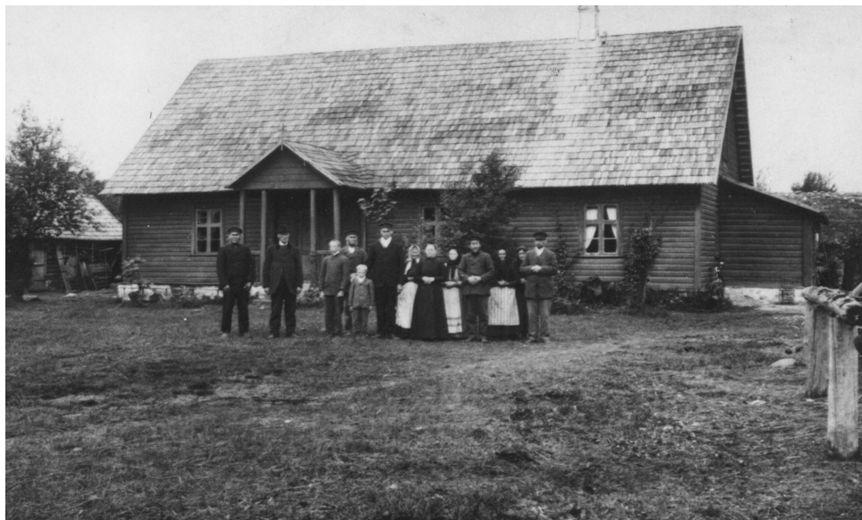
Fig. 3. The prayer house in West Estonia. Photo by M. Rukki, 1913 (Photo Collection of the Estonian National Museum, No. 1347: 40)

of Estonia, have occurred in Estonia after the decline of the Brethren movement. Since the Lutheran and Orthodox Churches remained remote of the Estonian peasantry and the percentage of Free Church members was low, there was actually no reason up to the 20th century to speak about a more serious adherence of Estonians to any Christian confession. The religious life of the 20th century, however, can rather be characterised with the word “secularisation” than “Christianity”. The answer to the question whether Christianity has ever been widely accepted in Estonia at all is rather in the negative than in the positive.