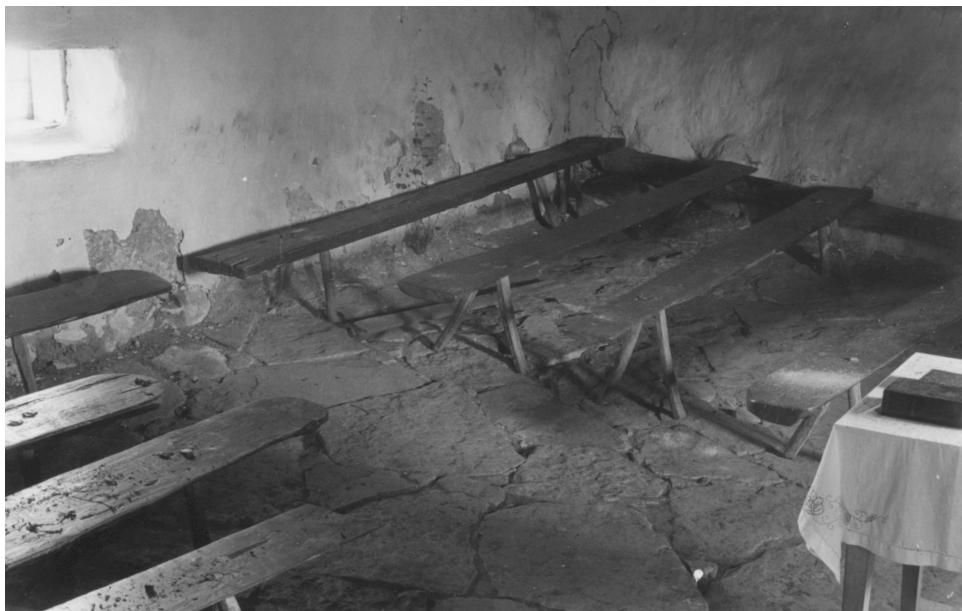
Fig. 2. The prayer room of the chapel of the Brethren congregation in Valjala parish, Saaremaa county, Estonia. Photo by E. Põld, 1938 (Photo Collection of the Estonian National Museum, No. 821: 6)

ment from the Lutheran Church to the Russian Orthodox Church. In the years 1845–1848, about 17 per cent of South Estonian peasantry transferred their allegiances from Lutheran Church to Orthodox Church, mainly motivated by economic and social hopes. The percentage of those who shifted church was highest in Saaremaa, where by the year 1848, 29.8 per cent of the peasantry had adopted Russian Orthodox faith (KRUUS 1930: 344, 400). After this shift, the Russian Orthodox Church began to build new church buildings and schools for the Estonian peasantry, thus entering into active competition with the Lutheran Church. In the 1880s, the tendency to convert from the Lutheran to the Orthodox Church broke out in North Estonia, with its centres in Läänemaa and Hiiumaa. Tsarist authorities supported the spread of Orthodoxy and took steps against the Lutheran Church, which caused the growth of membership in the 15 Orthodox congregations of Saaremaa up to 40 per cent of the population by the turn of the 19th-20th centuries. In Läänemaa and Hiiumaa, 13.2 per cent of the population were Orthodox in 1897. The census of 1897 reveals that 84.2 per cent of the total population of Estonia were Protestants (mostly Lutherans) whereas 15 per cent were Russian Orthodox or Old Believers (PERVAJA 1905: 122–125; PALLI 1998: 29–31).