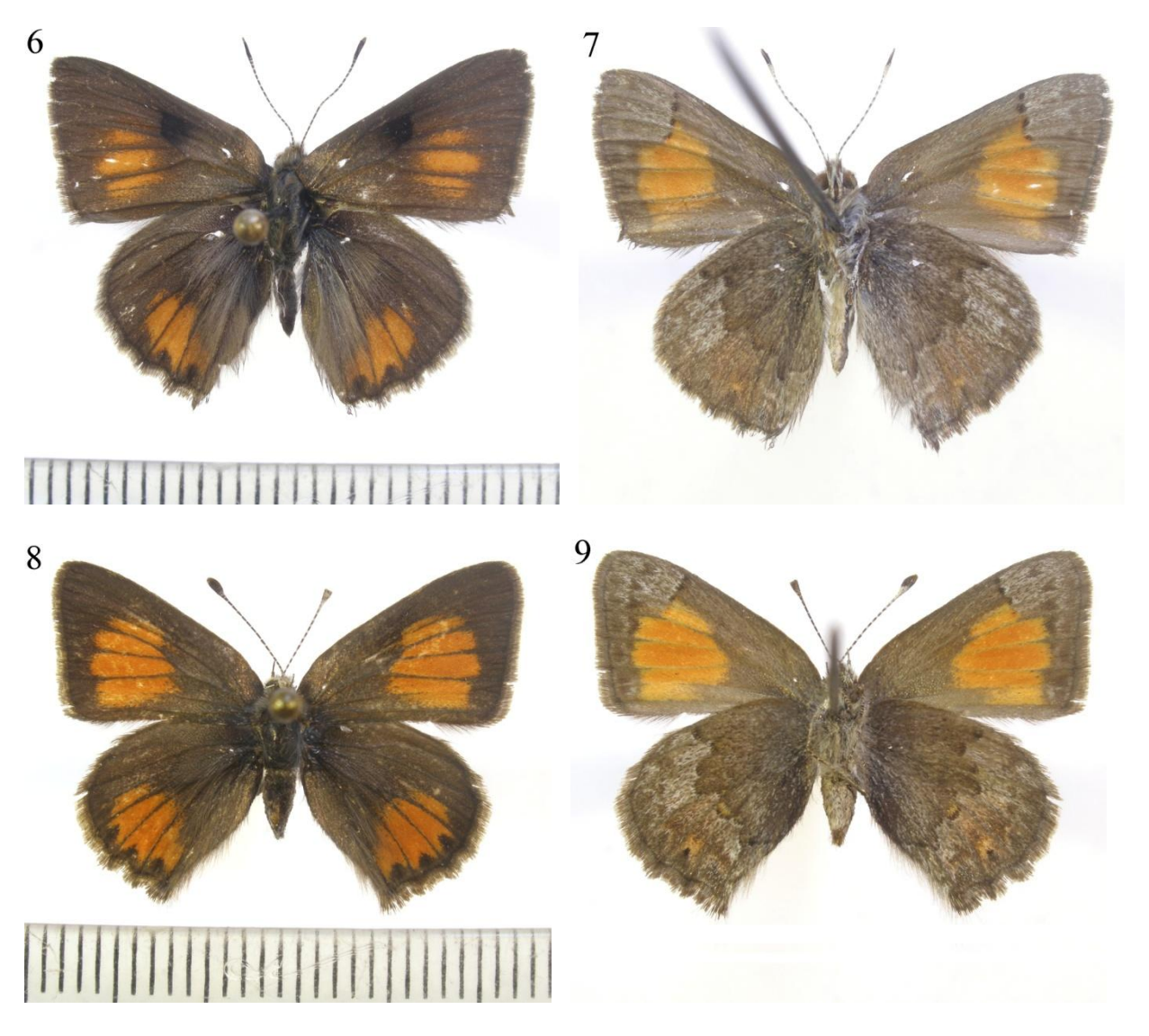
Figures 6-9. Strymon bicolor (Philippi, 1859) from Chile (Santiago, Villa Paulina, 2000 m, 1999, ex larva, leg. et coll. Dubi Benyamini, Bet Arye, Israel): 6 = male dorsal, 7 = male ventral, 8 = female dorsal, 9 = female ventral; (scale: 1 mm).

biological entities, therefore they deserve to be taxonomically recognized as species ( cf. Peña & Ugarte 1997: 210–215).