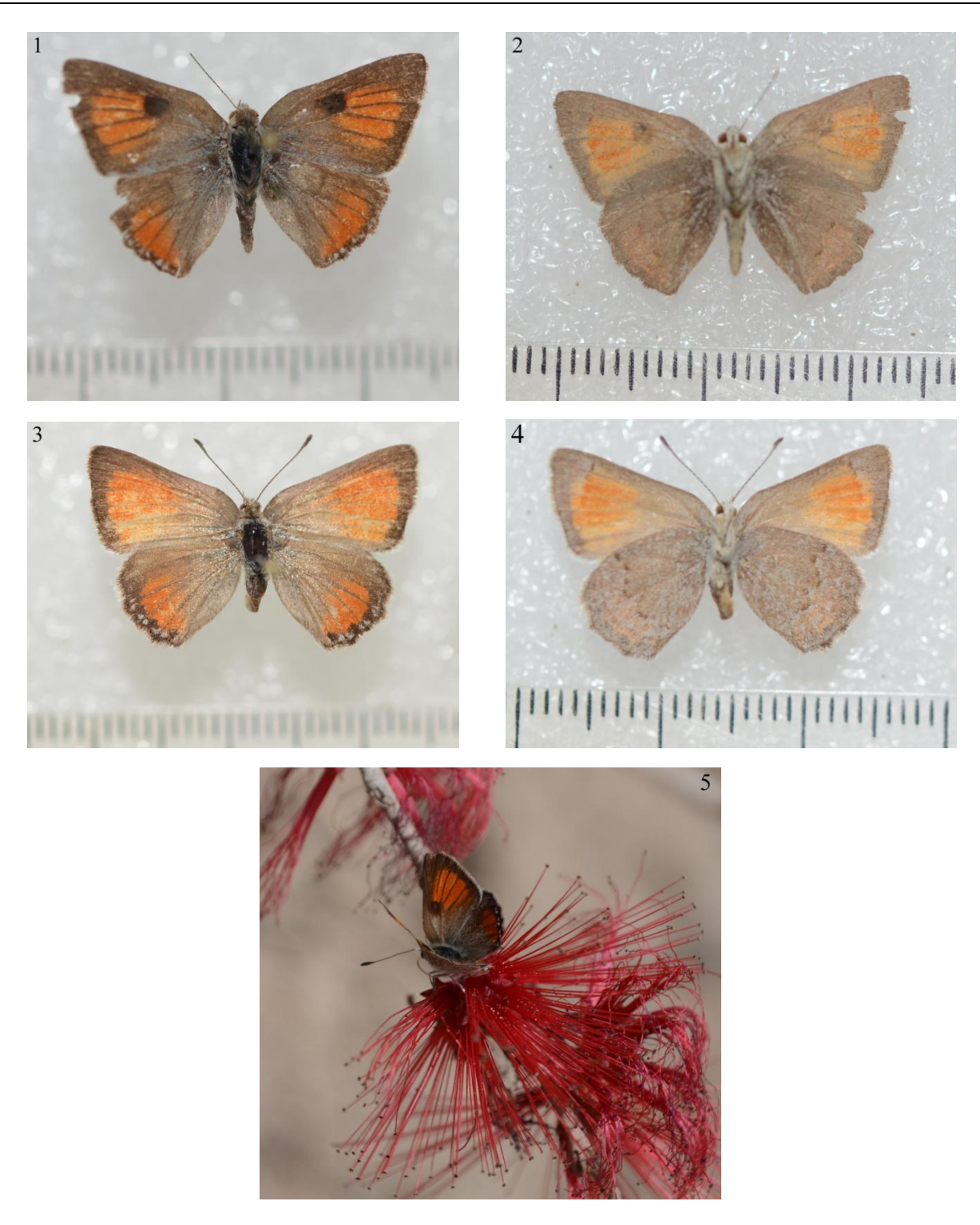
Figures 1-5. Strymon heodes (Druce, 1909) from Peru, Ancash, Caraz, 2400 m, 2002, leg. Weigend, MUSM: 1 = male dorsal, 2 = male ventral, 3 = female dorsal, 4 = female ventral; (scale: 1 mm). The gleaming scales are well visible in the basal area of the wings in both sexes. 5 = Fresh male of Strymon heodes (Druce) in nature perching on a red flower of Calliandra sp. (Mimosoideae, Fabaceae) in Peru, Department Ancash, Huaylas, at 2820m taken on 9.XII.2016. (photos: Dubi Benyamini).