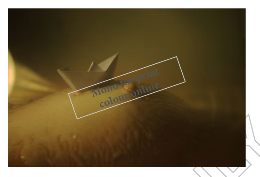
Figure 1. Samantha Sweeting. The Whiteness of the Whale , 2012. Photograph. The Moby Dick Big Read , curated by Philip Hoare and Angela Cockayne. Reproduced with kind permission of the artist.