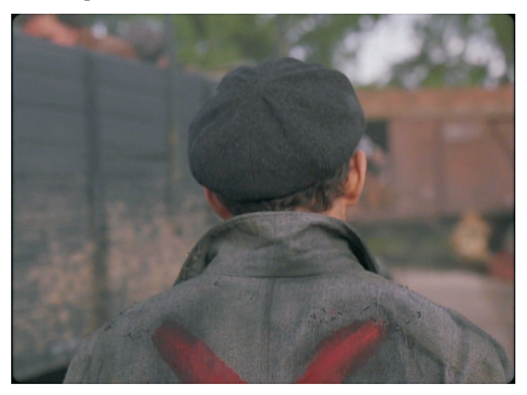
Figure 3. He seems to return to being a breathing, living human being.