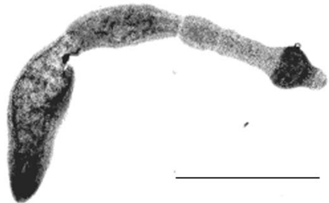
Figure 1. Echinococcus multilocularis isolated from a fox in Hungary. Scale bar: 0.5 mm.

All five foxes were shot in two northern Hungarian counties, Nógrád and Borsod-Abaúj-Zemplén, in the Nógrád Basin (Drégelypalánk, 48°02' North, 19°04' East, and Pusztaberki, 47°58' North, 19°11' East), in the Cserhát Mountains (Salgótarján, 48°03' North, 19°47' East and 48°01' North, 19°45' East) and in the Borsod Basin (Kelemér, 48°19' North, 20°27' East), near the Hungarian-Slovak border. The five places are in the Northern Mountain Range and at a distance of 60–120 km from the nearest known E. multilocularis -endemic region, the Muránska Planina Mountains (48°44' North, 20°02' East) in Slovakia (6). These territories are 200–400 m above sea level and are mainly forested, nonagricultural, or extensive agricultural areas. Based on the most important morphometric parameters of Echinococcus adult stages (length of the worm: 1.3–2.5 mm; number of proglottids: 3–5; length of terminal proglottids: 0.5–1.1 mm; terminal proglottids in percentage of total worm length: 26–44; position of genital pore: anterior to middle; form of uterus: sacklike without lateral sacculations), the parasites were identified as E. multilocularis (7). Although the overall prevalence of E. multilocularis seems to be low in Hungary, in the two E. multilocularis -endemic counties, the