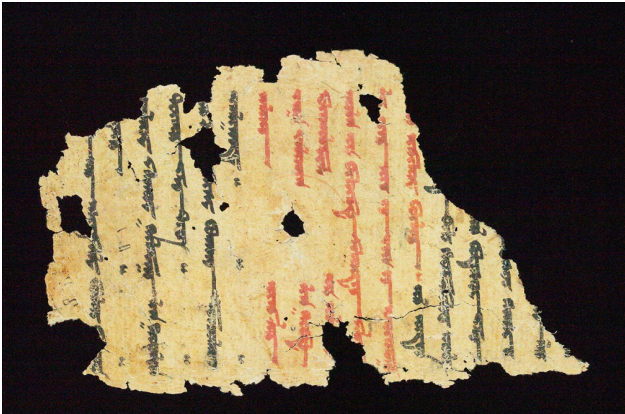
Figure 1. TLF 14894, recto