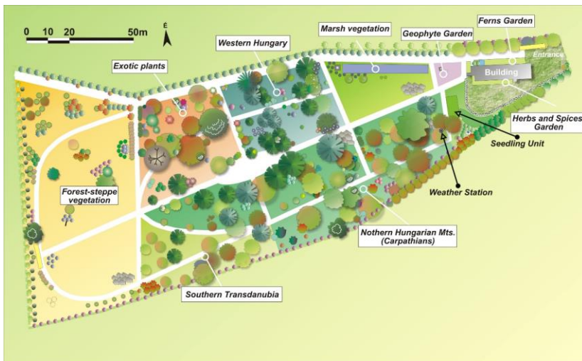
Figure 1. The map of the botanical garden of Eszterházy Károly University.

According to Geological map of Hungary, 1:200 000, the area of the BG belongs to Kiscelli Clay geological unit: open-marine clay, clay marly silt, clay mar. The soil type is slightly acidic brown forest soil with higher percentage of clay in the soil texture (Budai and Gyalog 2010).