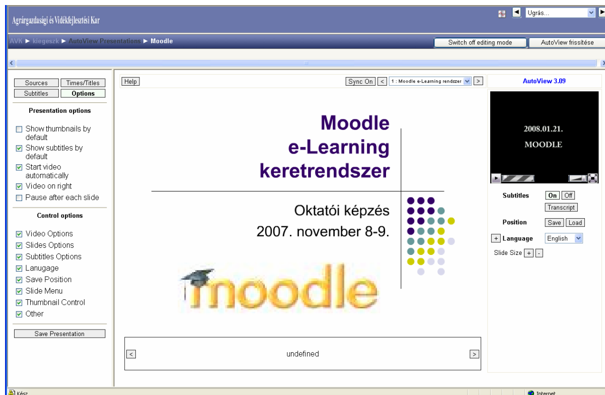
Fig. 1. Using AutoView module in Moodle