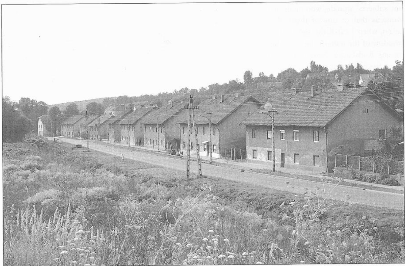
Figure 4. A part of a street in the colony in Rudabánya, in 1999.

This kind of criteria of the property's respect is determined both by antecedents and the events of the recent past. Among industrial workers who cultivated the land as well, it was accepted that anybody was allowed to occupy the land which was not farmed, cut down, ploughed, which was obviously without owner's care. The proprietorship or the tenantry of the land passed to the occupier without any complication. It was a real good working process – the negligent owner took this kind of change natural. 17 Owing to the fast increase in the number of inhabitants, the morals of the settlement became thinner and thinner. People, who hardly knew each other and who did not consider Rudabánya as their mother country, were not controlled by the moral power of the community. This process could not arise in the ironworks' colony. The natural fluctuation of the closed colony was not able to change the cohesion of the community. The cultural institution system of sanctioning, when it worked appropriately, could keep the freshers back.