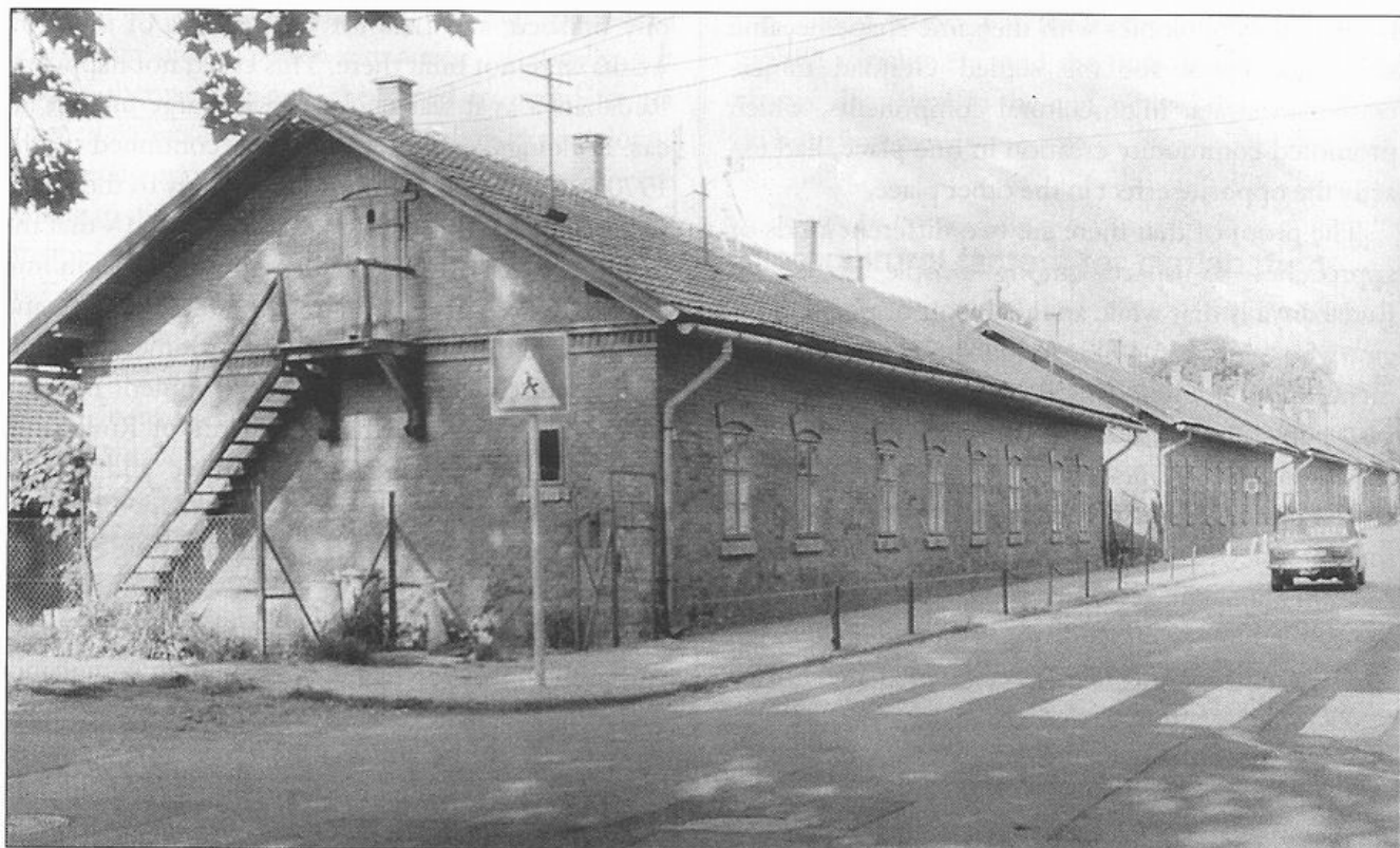
Figure 3. A part of a street in the ironworks' colony in Diósgyőr, in 1999.

higher culture. This mentality can also be observed today as one of my peasant informants said: 'miners aren't real men, because they dig upwards from below while we do downwards from above'.