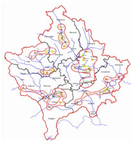
Fig. 1. Major prehistoric archeological sites, (Source: Authors plot, D. Hasimja, T. Jashari-Kajtazi)