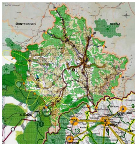
Fig. 7. Urban Potential of Kosovo

should be considered and used as the basis for furthering the research in the field of spatial and urban development; the regions as envisioned by this study may spring from common characteristics and may exceed the limitations posed by municipal or national boundaries ( Fig. 7 ).