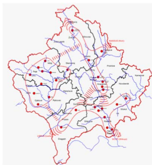
Fig. 2. Roman Settlements and itineraries

Late antiquity and early Byzantium: fortified settlements and the paleo Christian church architecture (4th to 6th AD) - During this period, the present day territory of