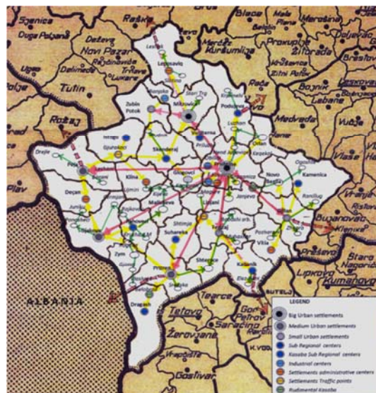
Fig. 4. Types of urban settlements in Kosovo in 1970s, (Source: Authors plot, D. Hasimja, T. Jashari-Kajtazi)

Socialist Modernization: Fragmented Urbanization and the Survival of the traditional (1945-1999) - One of the goals of the former socialist Yugoslav policies for urban planning was to diminish the differences between rural and urban lifestyles [4], for Kosovo this meant complete transformation of the oriental type of city (Fig. 4).