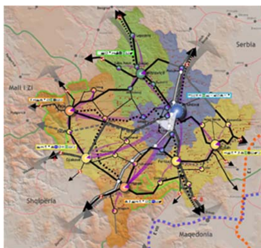
Fig. 6. Strategy of spatial development according to the Spatial Plan of Kosovo

In the case of Kosovo, this would mean to work towards: alleviating the unequal economic development rate, which has led to depopulation of the underdeveloped settlements, resulting in majority in migration from rural to urban areas, much more than from urban to more developed urban areas, and alleviating the differences in territorial development (urban patterns) between urban and rural.