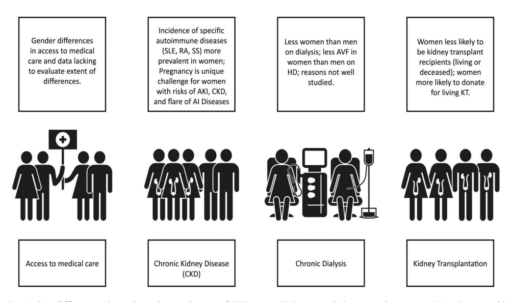
Fig. 1. Sex differences throughout the continuum of CKD care. SLE: systemic lupus erythematosus; RA: rheumatoid arthritis; SS: systemic scleroderma; AKI: acute kidney injury; CKD: chronic kidney disease; AI: autoimmune; AVF: arteriovenous fistula; HD: hemodialysis; KT: kidney transplant

Girls and women, who make up approximately 50% of the world's population, are important contributors to society and their families. Besides childbearing, women are essential in childbearing and contribute to sustaining family and community health. Women in the 21st century continue to strive for equity in business, commerce, and professional endeavors, while recognizing that in many situations, equity does not exist. In various locations around the world, access to education and medical care is not equitable among men and women; women remain underrepresented in many clinical research studies, thus limiting the evidence base on which to make recommendations to ensure best outcomes (Fig. 1).