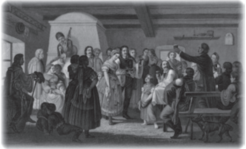
Welcoming the bride

The wedding feast ended, one of the most important of the marriage ceremonies, the "binding of the head", follows. The bride's hair, which, until now, she has worn loose and hanging down, is gathered up into a very elaborate knot, and the plaits are smoothly laid round her head, after which the head-