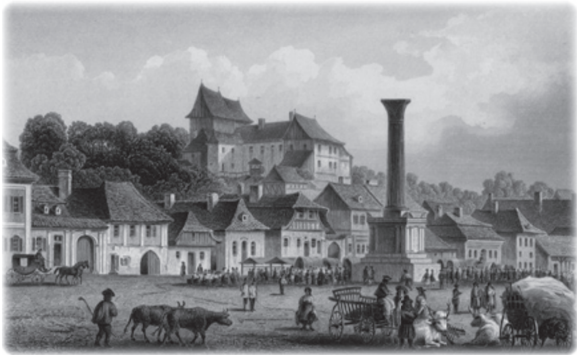
The market and the Piarist cloister at Marosvásárhely

air to its society. Maros Vásárhely is also the seat of the highest legal tribunal in Transylvania, the Royal table, and it is in consequence the great law school of the country. Almost all the young nobles who desire to take any part in public business, as well as all the lawyers, after having finished the regular course of study, think it necessary, under the name of Juraten , to pass a year or two here in reading law and attending the court.