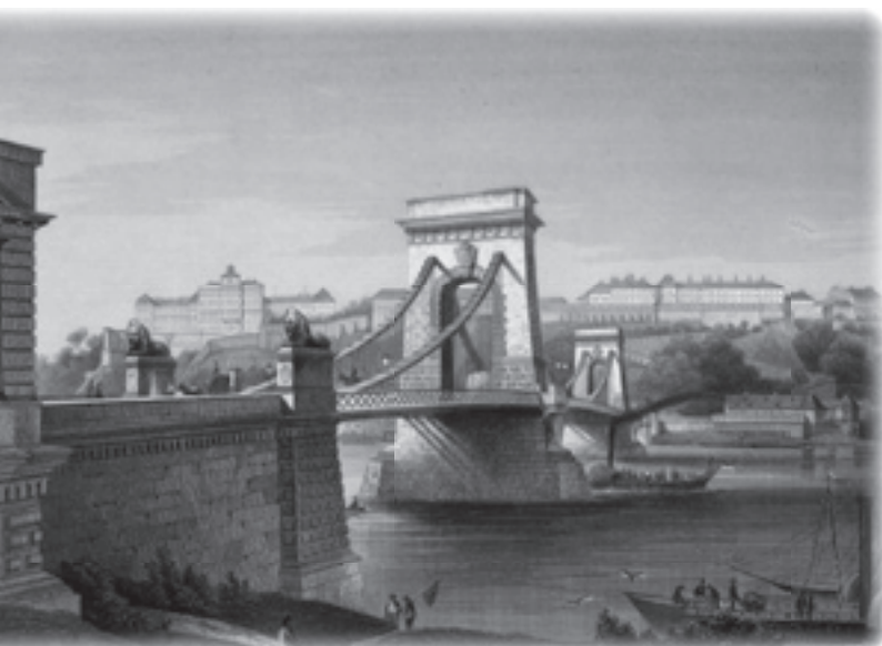
The Chain Bridge

[204] men, is Latin; that the gentry in the Slavonian and Wallachian districts are frequently Magyars; and that Jews, Gipsies, Greeks, and Armenians (especially the two former) are to be met with in considerable numbers in most of the towns, some idea may be formed of the linguistic confusion that prevails. Even the passing traveller can soon distinguish the guttural German from the nasal French sounding Slovak, or the rattling polysyllabic Magyar. [...]