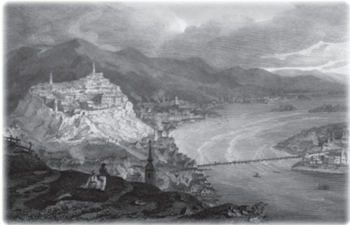
Buda Castle and a part of Pest

[9] From the 14th to the 15th the water continued sullenly and steadily to increase, spreading wider and wider, sapping and overthrowing dwellings, and drowning their panic-stricken inhabitants. But the day of horror – the acmè of misery – was the 15th itself. Pesth will probably never number in her annals so dark a day again – she might perhaps not be enabled to survive such another; – the mad