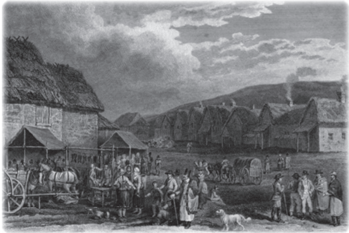
The market at Bata

Fünfkirchen. The railway, which is chiefly a mineral line, runs on into the coal-field, which is distant a few miles to the northeast, among hills of somewhat greater elevation than those near the town. It is likely to be continued westwards, and will, at Kanisa, fall into the main line already constructed between Pesth and Trieste, passing the Platten See. 2 The country that will have to be traversed is wild, and at present not much inhabited; but the opening thus made cannot fail to be of great importance, and will enable the Fünfkirchen coal to reach the Adriatic, and compete with that now brought at great cost from England. It is understood that in its whole course the river Drave runs through rich and productive lands, which only require means of communication to insure their yielding very large results. The proposed railway will not, indeed, run