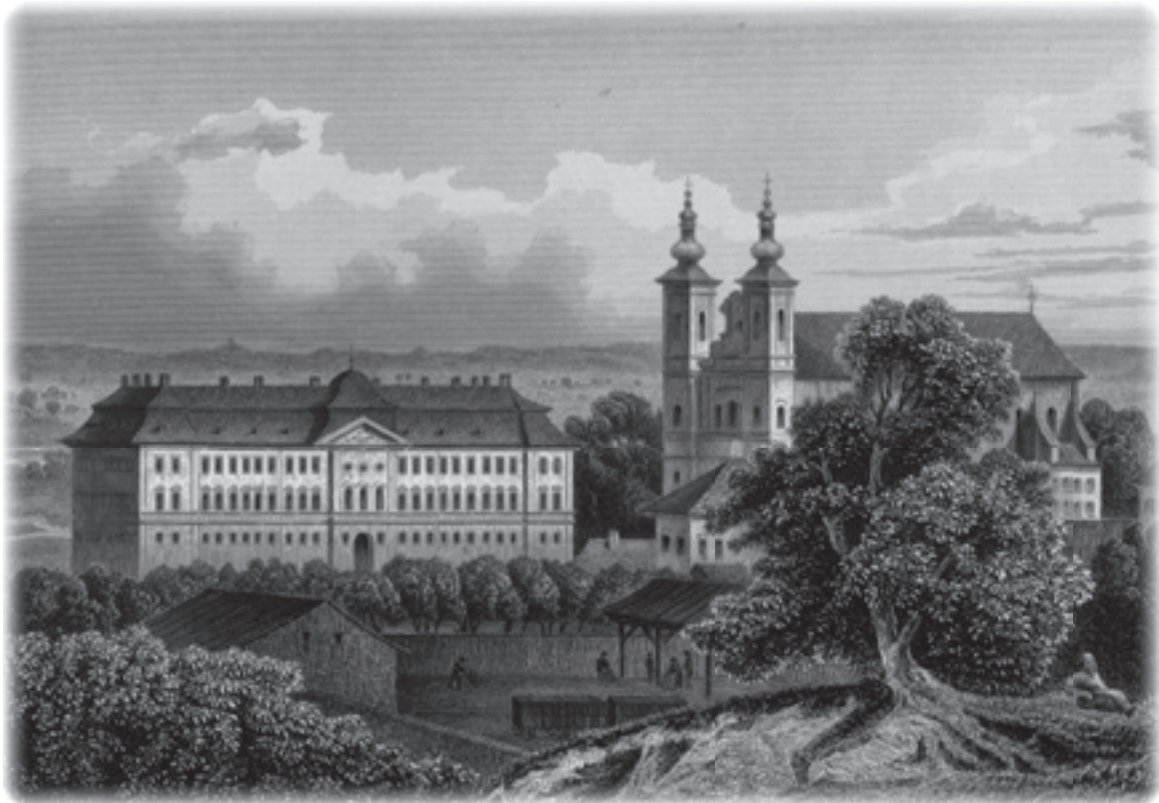
The bishop's palace at Nagyvárád

as may be seen in the map, 3 and many [253] of the lower orders of the inhabitants of this town are of this nation, which is a member of the Greek church, and follows the old style. This, therefore, was the Pentecost of the Wallachians; and a swarm of them was come here to enjoy the pleasures and