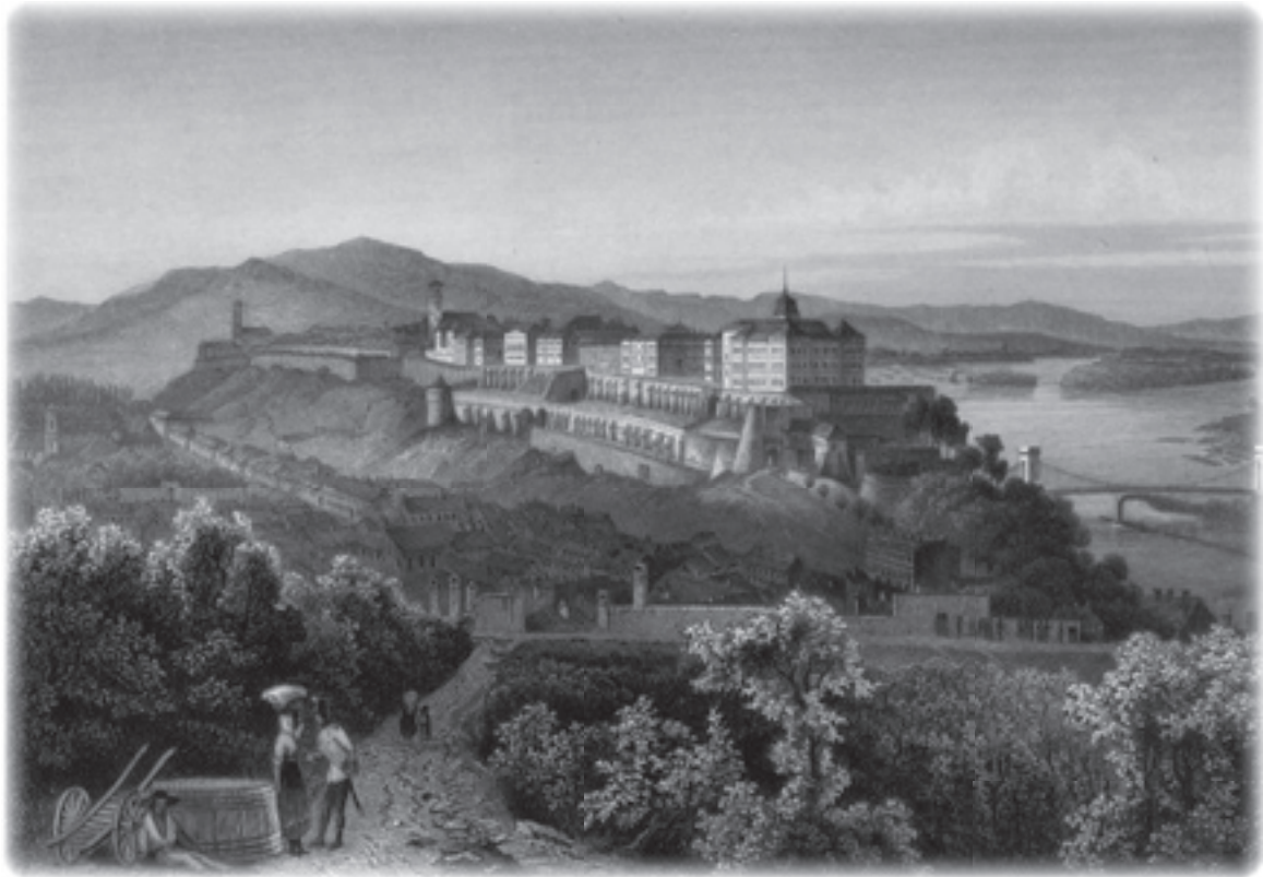
Buda Castle and Krisztinaváros

check other Barbarians. A district below the town is still shown as their city – having some ruins and an aqueduct, from whence a subterranean passage leads to the citadel above. The name of Buda is derived from Buda, a brother of Attila, in the fifth century. 2 It is by the Germans called Offen, or Upper, alluding to its high situation, and so it is always designated in German maps. It had been the residence of the native Kings of Hungary, which, when the Turks obtained possession of it, was transferred to Presburg. [...]