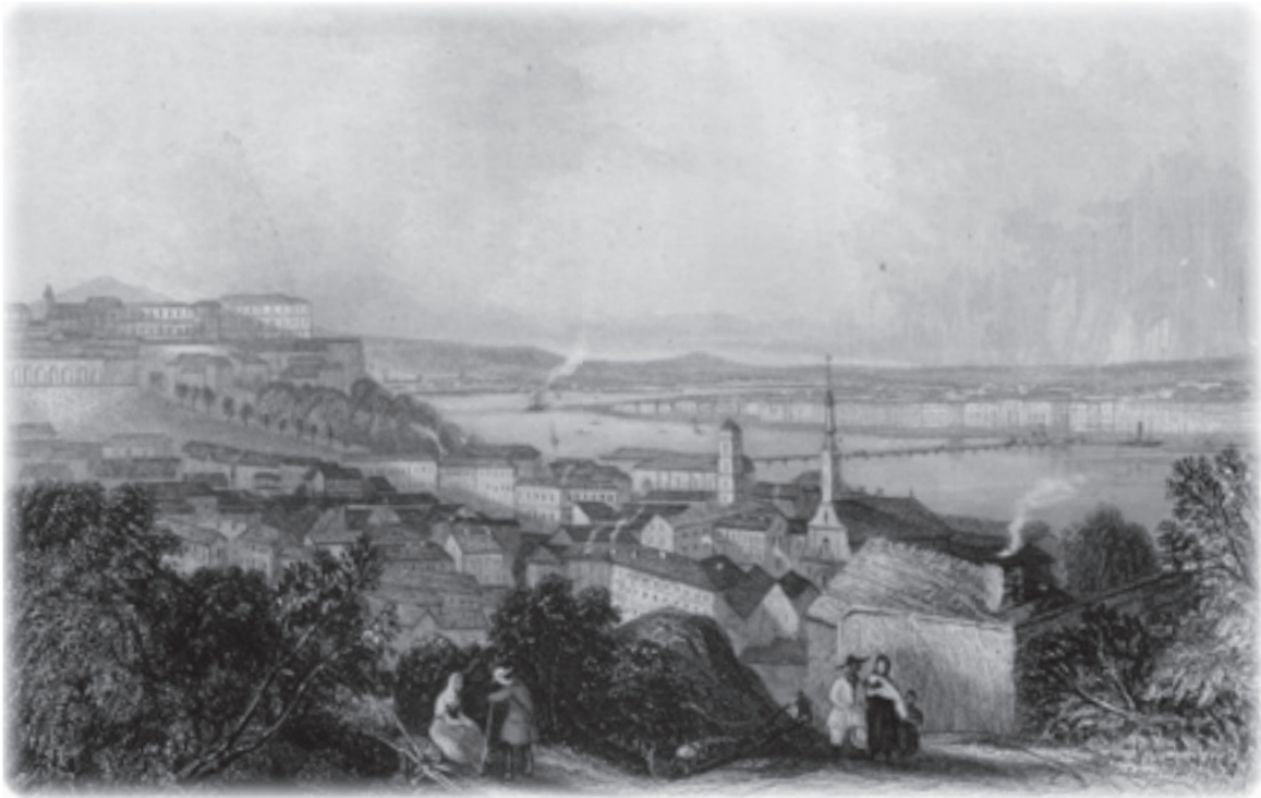
Buda and Pest

and poor part of Buda is past, and the much more modern and better-built, if less-picturesque, city of Pesth contrasts with it on the opposite side.