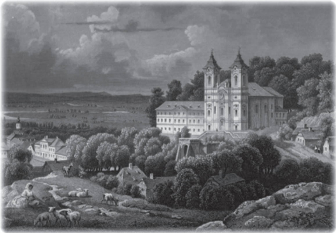
The cloister at Máriaradna

told, on inquiry, that it was so, though from [339] what cause could not be known. The chapel is spacious and elegant, with a fine organ. The roof was painted with the Assumption of the Virgin, who was trampling the crescent under her feet in her ascent. Compartments in the wall represented different actions in the life of St. Francis, by a German artist of Pest; and the rest, like those of the gallery, were covered with votivae tabellae . But that which attracted most attention, was the picture of the Virgin herself which had worked all the miracles, and was hanging over the High Altar. It was a paltry painting, about two feet square, representing a female encircled with a large gilt crown, holding out an infant decorated with another. It was blackened, apparently, with smoke; and when we inquired the