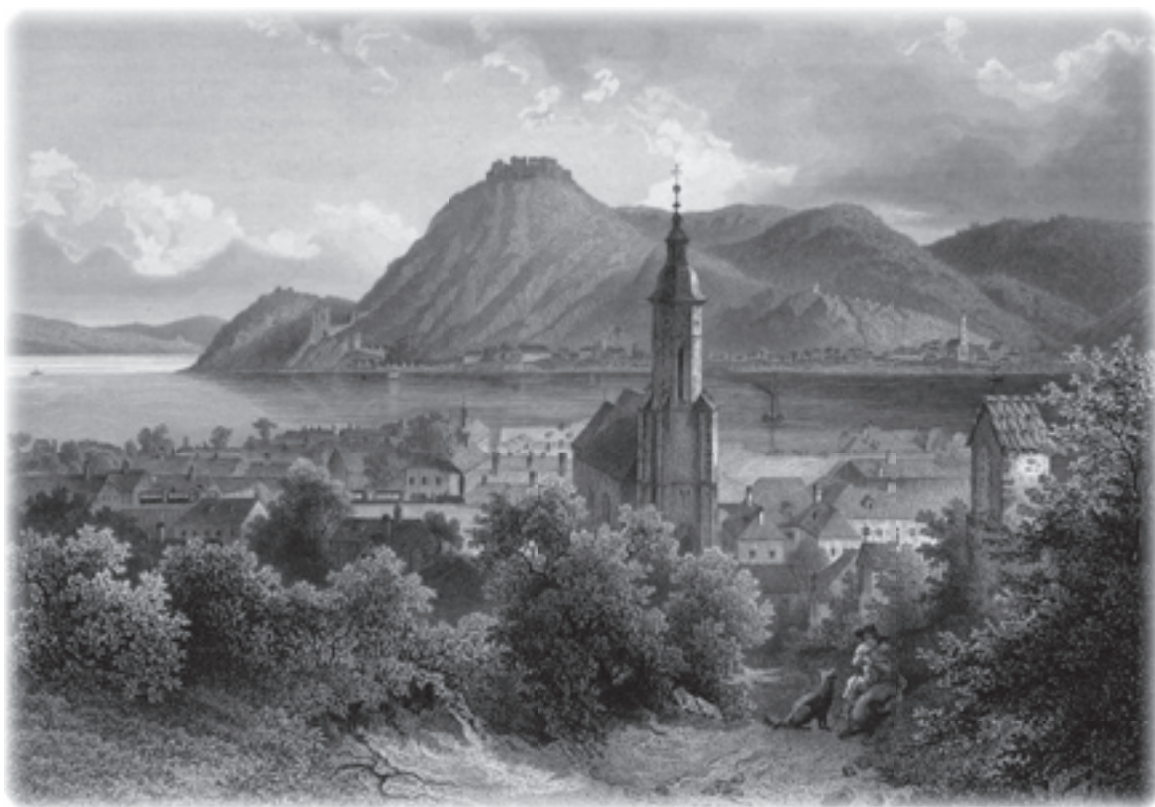
Nagymaros and the fortress of Visegrád

called Salomon's Tower, from that king having been imprisoned there for eighteen months by his rival Ladislaus. The ruins of the castle are considerable, but none of the apartments remain entire, and it is falling fast to decay. The Hungarians, indeed, have given themselves but little pains to preserve, or elucidate, the antiquities of their country, nor, as far as I can learn, has any engraving ever been published of this very remarkable and interesting spot. The views from it are, in a high degree, beautiful and romantic. The windings of the Danube, the boldness and inequalities of the opposite shore, the pleasing mixture of wood and rock, vineyards and cornfields, bounded by distant hills, contribute to form a rich, a varied, and an enchanting landscape. [...]