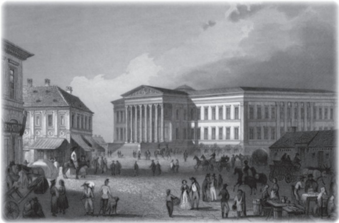
The National Museum in Pest

continent, altering its climate to correspond with the change in the level of land. At this early period elephants, rhinoceroses, and even hippopotami, ranged from Asia and Africa into what is now eastern Europe, and adapted themselves to the circumstances of the country. They met here gigantic bears and large feline animals, horses, and also that singular large-horned deer ( Cervus megaceros ), [213] whose proportions may be judged of from the Irish and Isle of Man specimens in all the principal museums of England, and by the restorations so ably effected in the Crystal Palace gardens, at Sydenham.