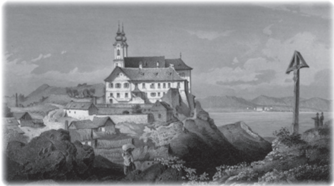
The Benedictine abbey at Tihany

and open-heartedness, and their manners for a sort of straight-forward bluntness, indicating a greater love of truth than courtesy. Strongly attached to liberty, they are impatient of control, and submit with a bad grace to any new laws which may tend to encroach, even in the slightest degree, upon their national [33] independence; consequently, the well-ordered Austria, with all its complicated government machinery, has never been able to impose upon them the yoke of passports, and a hundred other vexatious ordinances; hence the traveller, who has once passed the frontier, may journey throughout the whole of Hungary without the slightest interruption. The Magyar is also so patriotic, that he not only tells you, but firmly believes, that his country is the freest and greatest in the world. [...]