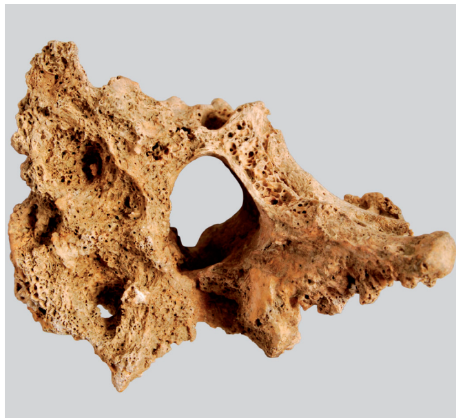
Fig. 8: Tuberculous bone loss at the lower part of the 9 th thoracic vertebra

In the Alsónyék series the “classic” deformations typical of tuberculosis were found on the remains of an adult male skeleton buried in grave No. 4027 resting on four wooden pillars. 10 The severe vertebral damage was already well visible during the excavation (Fig. 5). The most characteristic alterations occurred on the segment between the 4 th lumbar and 10 th thoracic vertebrae. On this segment of the spinal column the decay, collapse and fusion of vertebrae are observable, which lead to the characteristic wedge-shaped bending in the arch of the spinal column, leading to the development of the so-called Pott's curvature (Fig. 6). Further synostosis occurred at the 8 th and 9 th thoracic vertebrae (Fig. 7). Deep cavities are observable at the lower part of the body of the 9 th thoracic vertebra, which destroyed about half of the body (Fig. 8). Macroscopic observation was completed with radiological examinations (Fig. 9), clearly showing the total destruction of