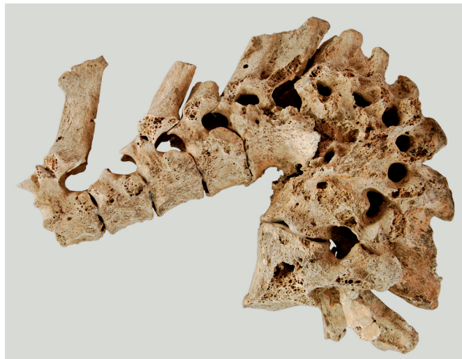
Fig. 6: The classic Pott's curvature observed on the spinal column of the man