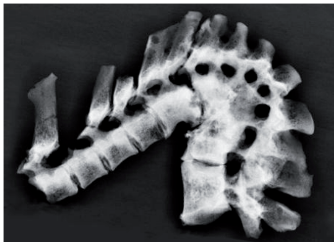
Fig. 9: X-ray image of the spinal column

Further on, apart from the person showing the classic symptoms of the disease buried in grave No. 4027, we are going to examine the presence of the atypical syndrome on all of the skeletal finds excavated in this group of graves, in cooperation with the Department of Anthropology of the University of Szeged. We are also going to investigate whether the DNA remnants of the pathogen can be detected on the bones. Thus, the infection will be possible to confirm even in those skeletons where it could not be established with the methods of traditional anthropology. 14