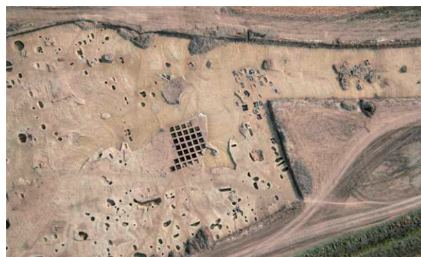
Fig. 2: Aerial photograph of the site