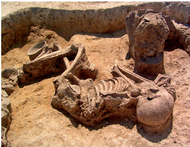
Fig. 5: “In situ” excavation photo of the man buried in grave No. 4027.