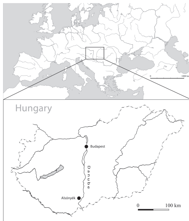
Fig. 1: Alsónyék-Bátaszék

Tuberculosis is one of the oldest infectious diseases, which has been hitting the human race for several millennia. It took its heaviest toll at the time when industrialization gained speed in the 18 th –19 th century, among physical workers living in poverty at a low level of hygiene, but it did not spare the higher social classes either. The disease, an endemic, was also represented in the art – music and literature – of the age as a tragic phenomenon that broke the career of talented youths (e.g. the novel The Magic Mountain by Thomas Mann, or Erich Maria Remarque's Three Comrades ). After Robert Koch discovered the pathogen of the disease in 1882, the introduction of different antibiotics and the BCG vaccine, as well as the effective propaganda and the establishment of TB clinics and medical examination centers contributed towards overcoming the disease by the second half of the 20 th century (Figs 3–4). However, by the turn of the millennium the number of infected people grew significantly, so