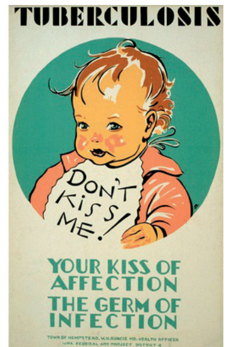
Fig. 3–4: Campaign against tuberculosis between the two world wars. Posters by Erik Hans Krause