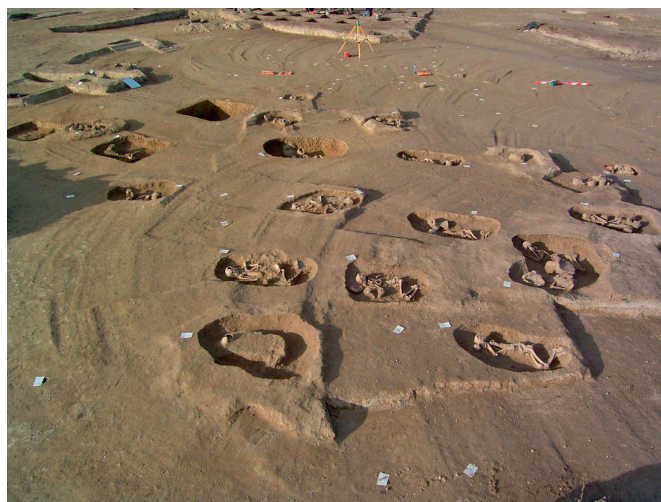
Fig. 10: Photo of a group of graves