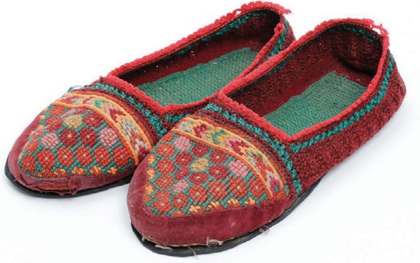
Fig. 5. Slippers from Harta