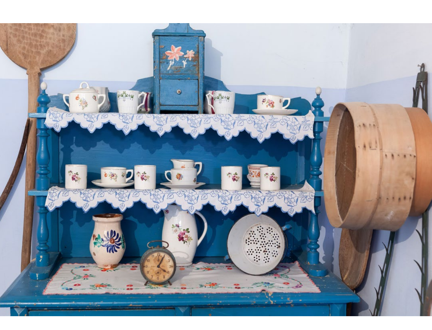
Fig. 2. Ceglédbercel, interior of the kictchen