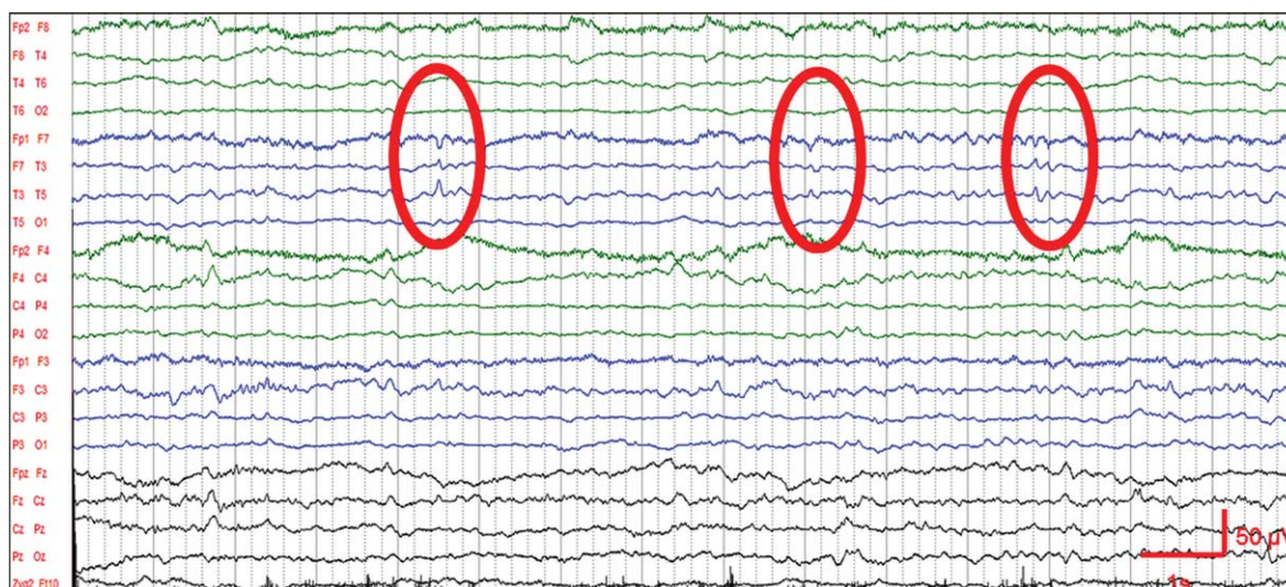
Fig. 2. EEG section from a 24-hour EEG recording of the same AD patient than in Fig. 1. There is an interictal sharp wave in the left temporal region with phase inversion at F7 electrode (circles).

patients without seizures but with epileptiform discharges (AD+ED; n = 12 ). Data were compared with Kruskal-Wallis and independent ANOVA analysis. The three groups did not differ significantly in gender and age; however, they showed differences in several clinical features as it is demonstrated in Table 1.