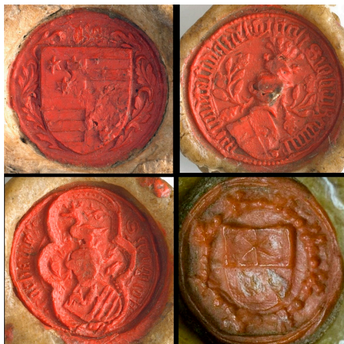
Figure 5. Seals of Ulrich, count of Cillei/Cilli/Celje ( top-left corner ), John Kórógyi, count of Castell ( top-right corner ), and Gregory Korbáviai, count of Korbávia (Krbava, bottom-left corner ) from 1440. Archiwum Główne Akt Dawnych Zbior Doc. Perg. Nr. 5574. ( Memoria Hungariae 2015 , 11342., 11344., 11345.). The seal of Stephen Frangepán/Frankopan, count of Veglia/Krk, Zengg/Senj and Modrus/Modruš ( bottom-right corner ) from 1451 ( MNL OL DL 2009 , 33 986.).