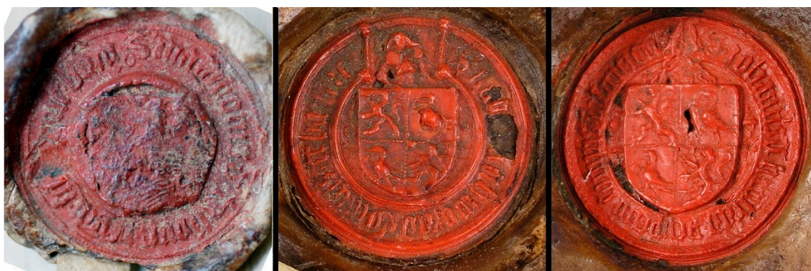
Figure 6. The seal of Matkó/Matthias Tallóci/Talovac, count of Cetina from 1442 (left side). The seals of John Hunyadi and his elder son, Ladislaus count of Beszterce/Bistritz/Bistrița from 1456 (middle and right side).

However, the number of perpetual comes and count titles increased continually from the 1440s. Matkó/Matthias of Tallóc/Tallóci/Talovac and his family became the count of Cetina in 1442 (Mályusz 1980). Following the death of Władislaus I (1440–1444, Władysław III of Poland), John Hunyadi was elected to rule the country as a governor; he used red wax for his seals. After Ladislaus the Posthumous (1440–1457) returned to the country in 1453, Hunyadi was given the title Count of Beszterce/Bistritz/Bistrița; thus, he did not suffer any loss in prestige after his governorship ended (MNL OL DL 2009, 24 762.). An increasing number of landowners rose in rank to the level of barons. They were perpetual comites/ispánok or counts and were privileged to use red wax (see Figure 6).