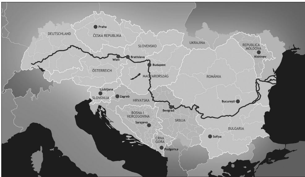
Figure 1: EDRS countries

The European Danube Region Strategy (EDRS) was adopted by the Hungarian Presidency on 30 June 2011 in Budapest. It was the second EU macro-regional strategy, which followed the EU Strategy for the Baltic Sea Region. A first Report to the European Parliament, the Council, the European Economic and Social Committee and the Committee of the Regions concerning the EUSDR was issued on 8 April 2013. 4