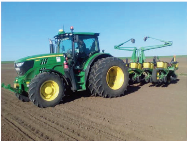
Figure 2. An John Deere 6150R with the StarFire 3000 Receiver

The StarFire 3000 receiver (Figure 2.) picks up satellite signals from the Global Positioning System GPS and has the capability to use GLONASS satellites (Russian navigation satellite system, similar to GPS) to maintain guidance performance even in shaded conditions and other unpredictable environments. Moreover, the receiver is designed to utilize satellites as low as 5 degrees above the horizon. Due to the improved satellite availability, the StarFire 3000 provides a more reliable position. John Deere terrain compensation technology with the StarFire 3000 receiver provides the capability to detect the roll, pitch, and yaw of the vehicle. So the receiver can compensate accordingly to ensure true vehicle position with respect to the ground throughout the field [9].