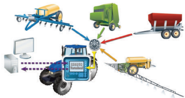
Figure 4. The data relationship between the tractor and implements with Isobus [9]

For the agricultural machinery industry, it has been of vital importance that the end customer, the farmer, can decide freely among individual products, and can combine machinery of different manufacturers. This has been achieved via uniform interface standards e.g. the three-point hitch or the ISOBUS connection between tractor and implement (Figure 4).