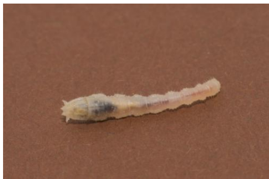
FIG. 1. Dorsal view of a late instar larva of Vermileo vermileo.

Newly-hatched wormlion larvae have an average length of 2.5 mm (Hafez and El-Moursy 1956a), while for mature ones their length can reach over 12–14 mm prior pupation (Fig. 1). The colour of the larvae is light yellowish, their body is translucent, and the alimentary canal and its content is clearly visible and recognisable. The eighth abdominal segment terminates in four conical fleshy lobes. The building of pitfall trap is performed by the head, while in the case of antlions the terminal setae of the abdomen has also an important digging role. Total developmental period of larvae is extremely long (3 to 4 years) during which several larval instars are included. The duration of the larval stage is largely influenced by the quality and quantity of nutrients, as well as by climatic conditions (Séméria 2006). Development of the wormlion pupae lasts 9–10 days, depending on temperature (Le Fauchaux 1961).